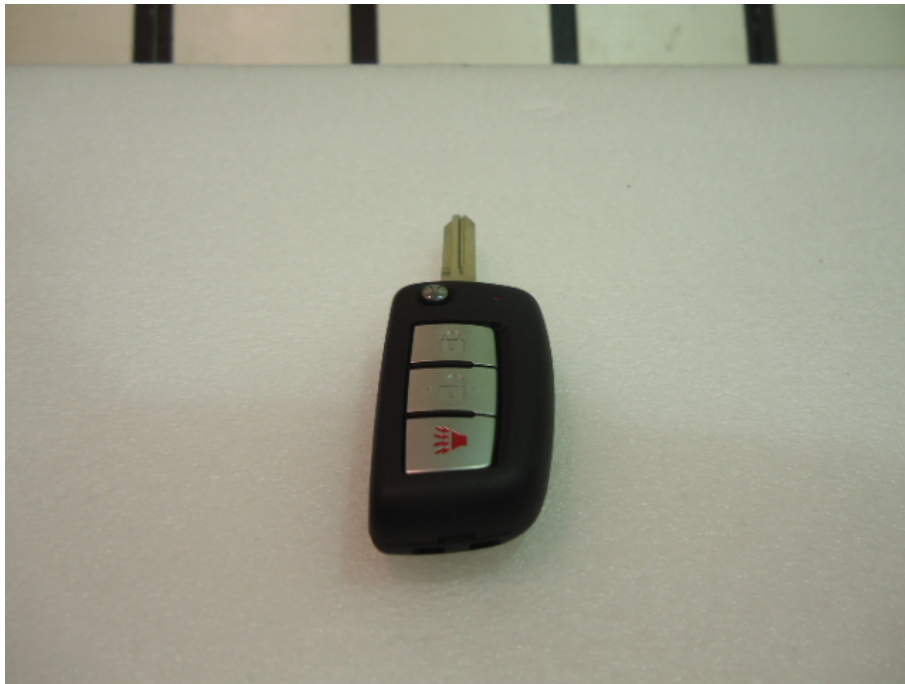
Mechanical Key (folded out) Worst