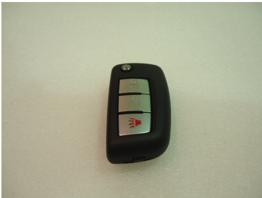
Mechanical Key (folded in)