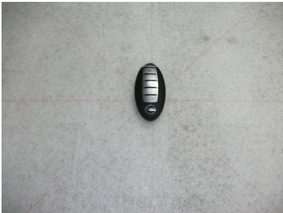
Mechanical Key (Inserted) Worst