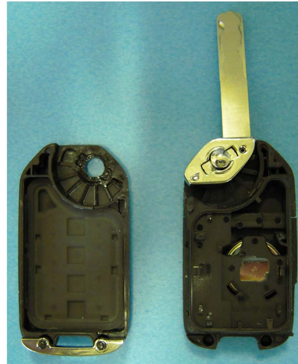
Inside of case