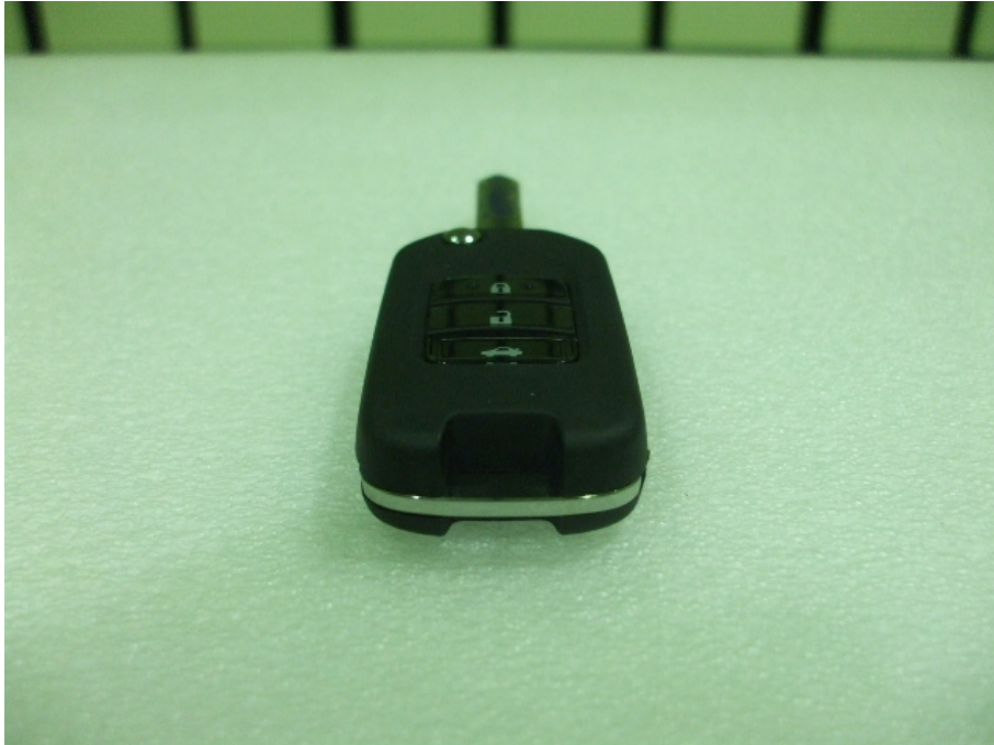
Mechanical Key (folded out) Worst