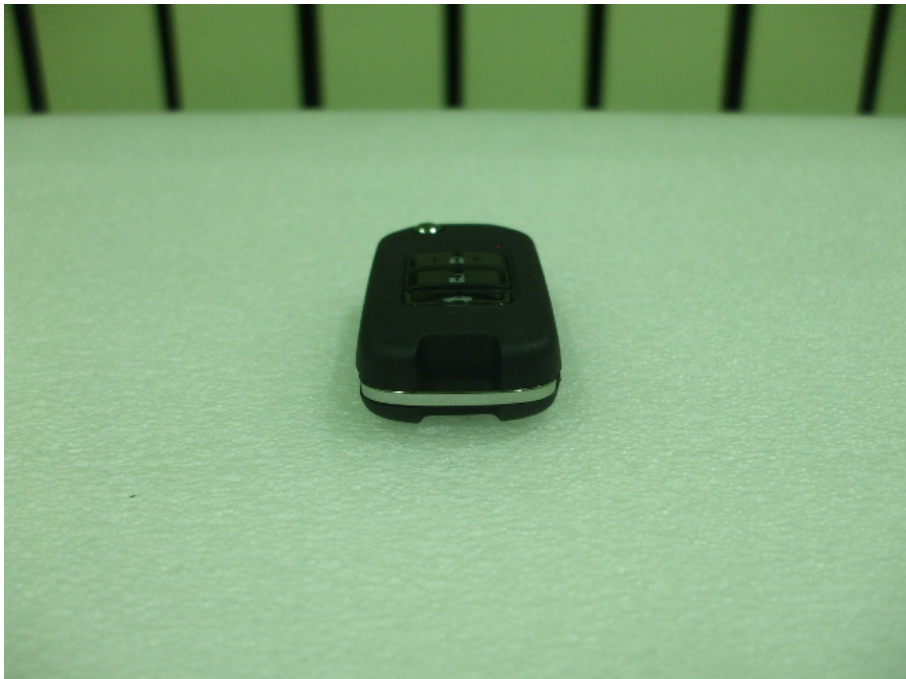
Mechanical Key (folded in)