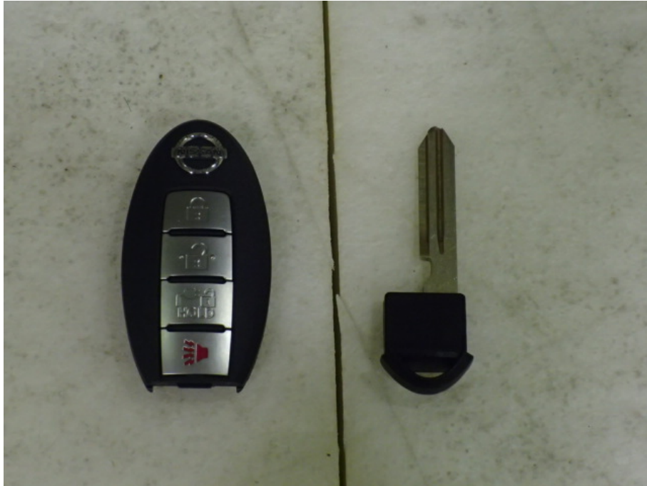
Mechanical Key (Not Inserted) Worst (Below 1 GHz)