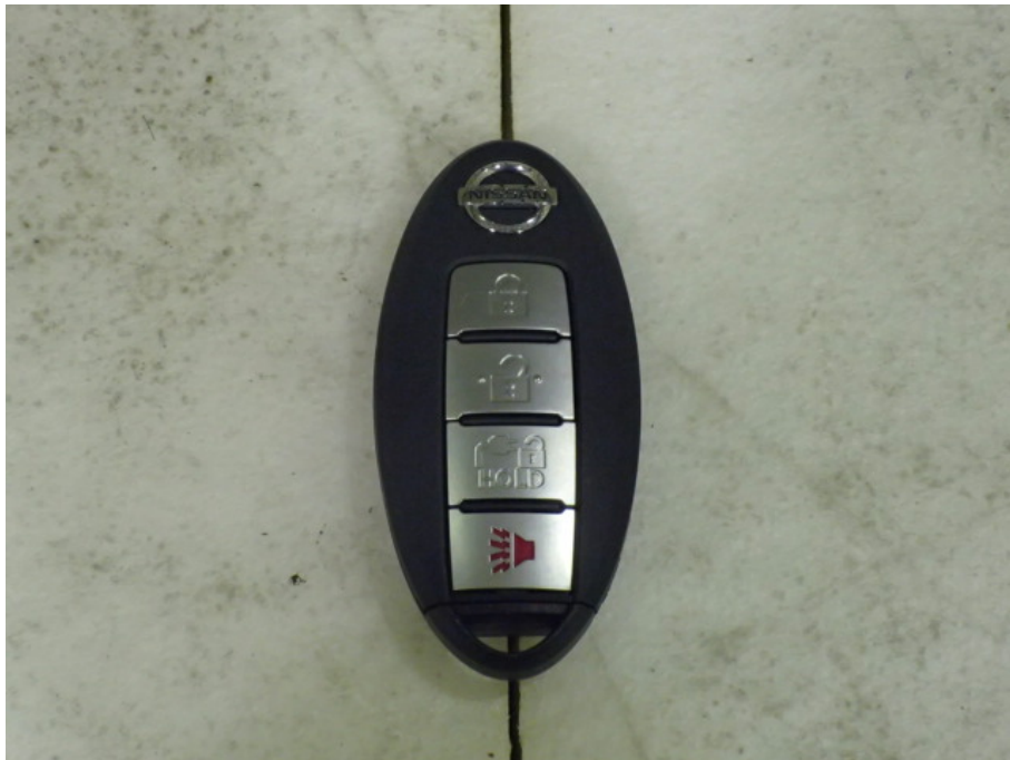
Mechanical Key (Inserted) Worst (Above 1 GHz)