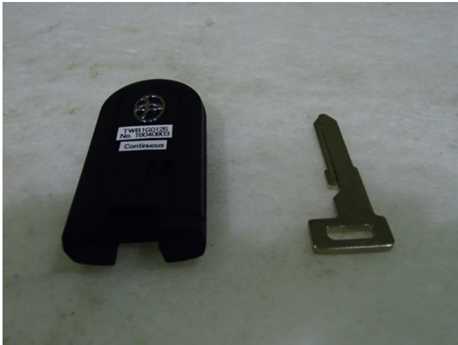
Mechanical Key (Not Inserted) Worst