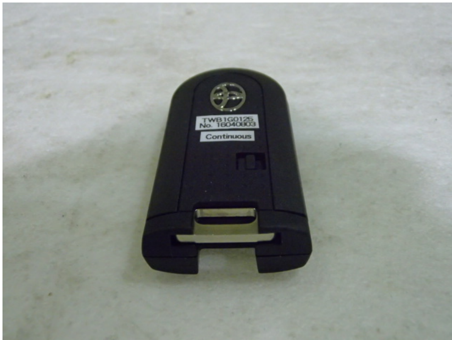
Mechanical Key (Inserted)