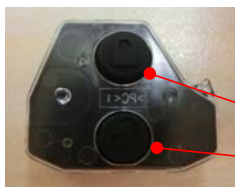
LOCK Button UNLOCK Button

When the user pushes LOCK, UNLOCK, and the PANIC button of HAND UNIT, the RF electric wave is output, and TUNER receives it, and an open lock, the close lock of the door, and the signal of the trunk opening are output.