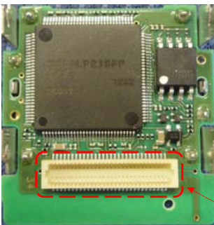
Bottom side view