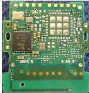
Internal view (Removed shield cover;