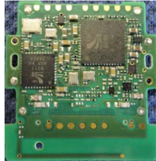
Internal view (Removed shield cover)