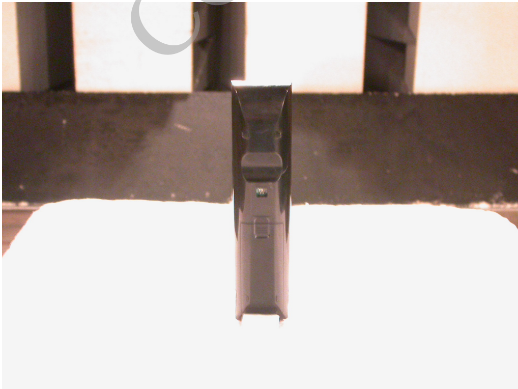
- X axis -