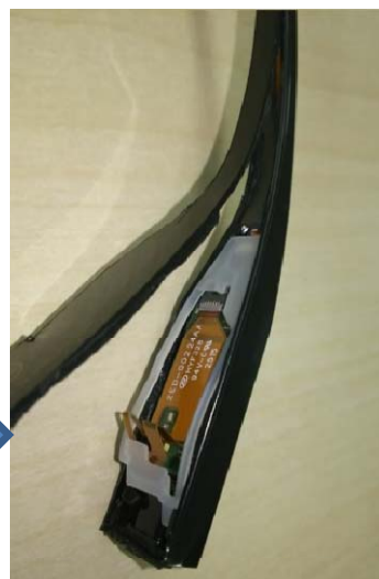
Wireless module installation