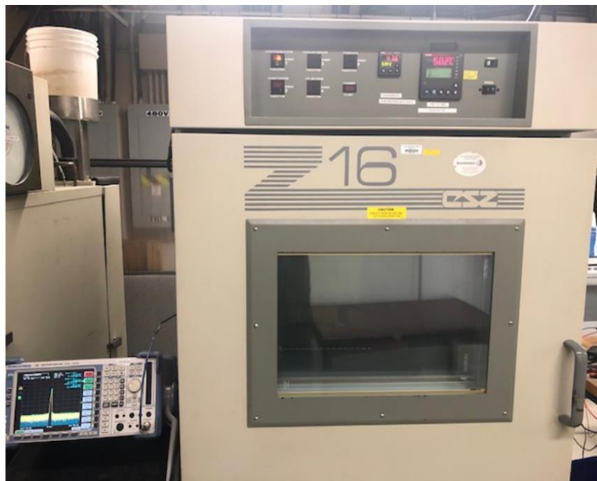
Frequency Stability Measurement Setup