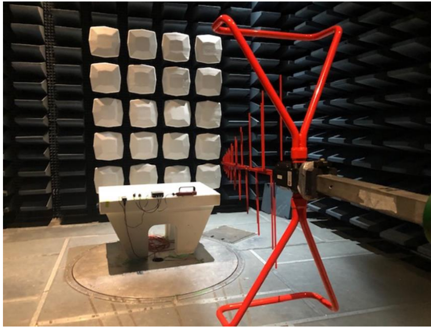
Radiated Emissions Measurement Setup, 30MHz – 2GHz