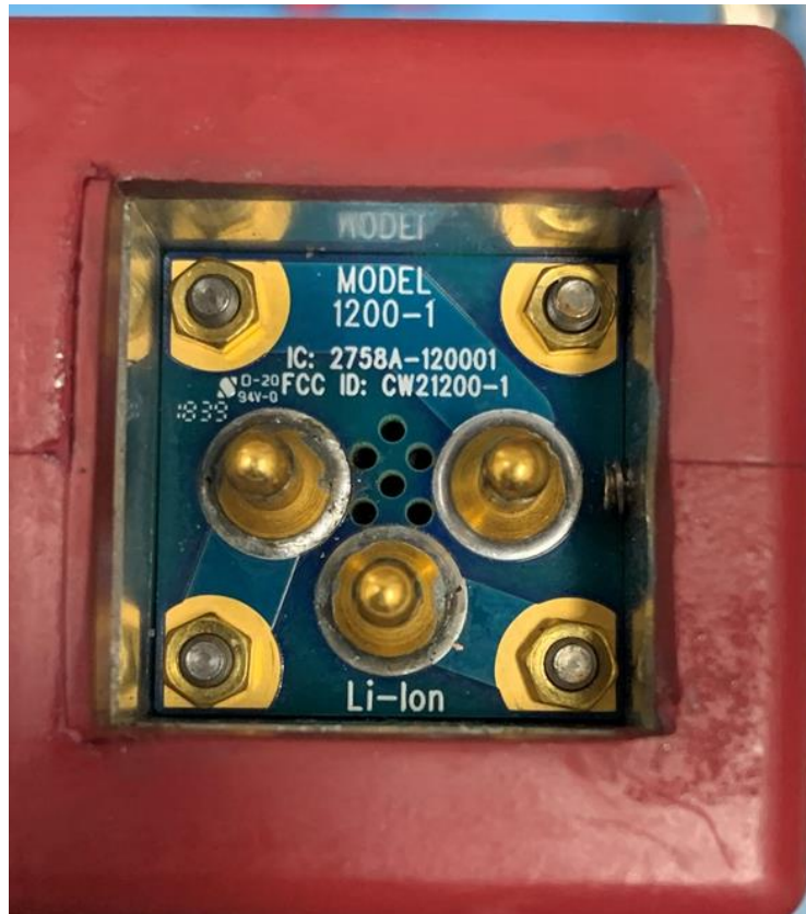
Figure 2 Photograph of Label