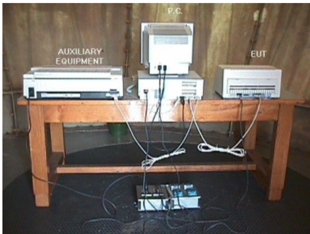
picture 5: radiated measurements rear view serial RS232 transmission