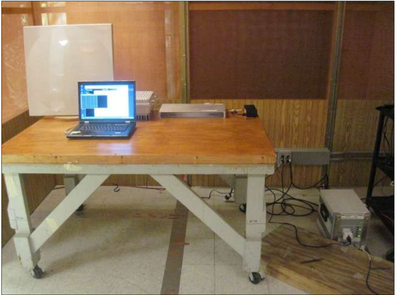
Photograph 4. Conducted Emissions, 15.207(a), Test Setup