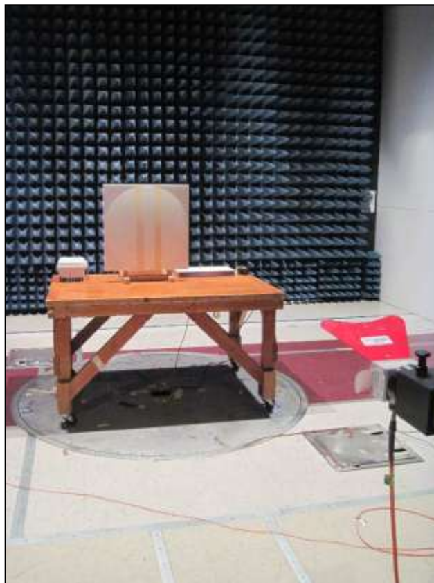
Photograph 6. Radiated Spurious Emissions, Test Setup, 1 GHz – 18 GHz