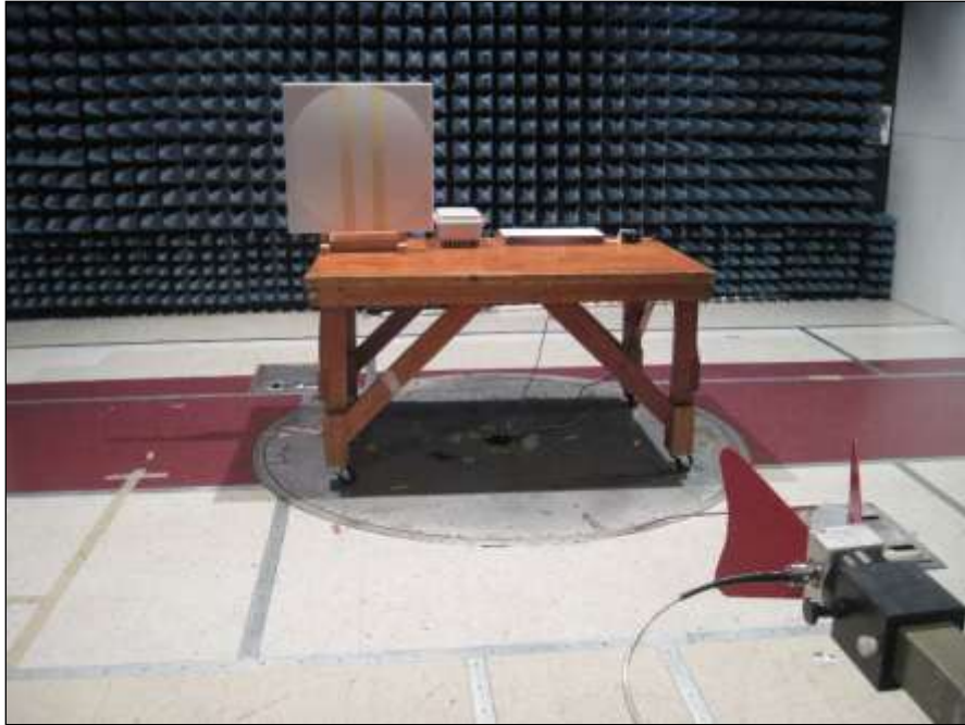
Photograph 2. Radiated Emissions, Test Setup, 1 GHz – 10 GHz