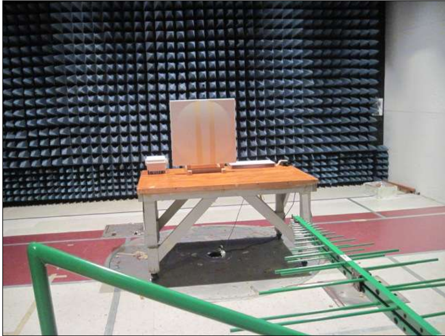
Photograph 5. Radiated Spurious Emissions, Test Setup, 30 MHz – 1 GHz