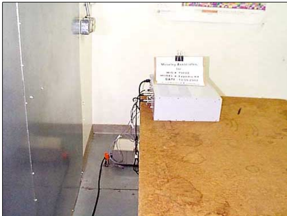
Mains Conducted Emissions - Side View - Receiver