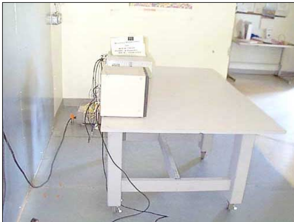
Mains Conducted Emissions - Side View