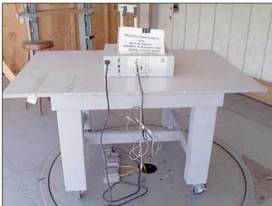
Radiated Emissions - Back View – Receiver