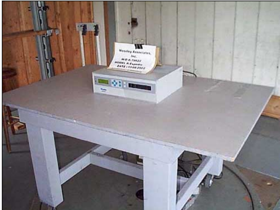
Radiated Emissions - Front View - With UTP Removed