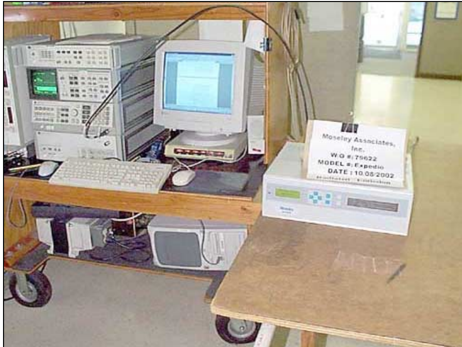
15.111 - Front View