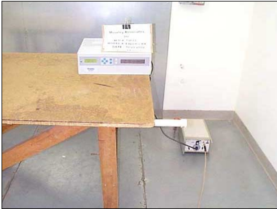
Mains Conducted Emissions - Front View - Receiver