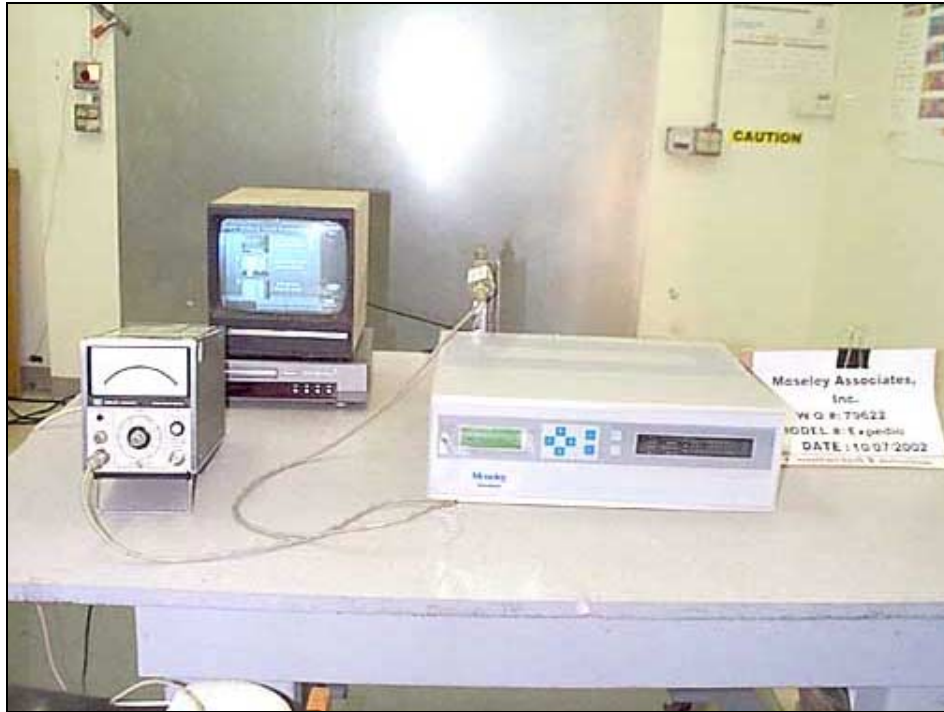
Direct Connect - Front View