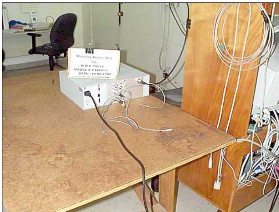
15.111 - Back View