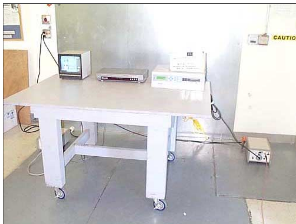
Mains Conducted Emissions - Front View