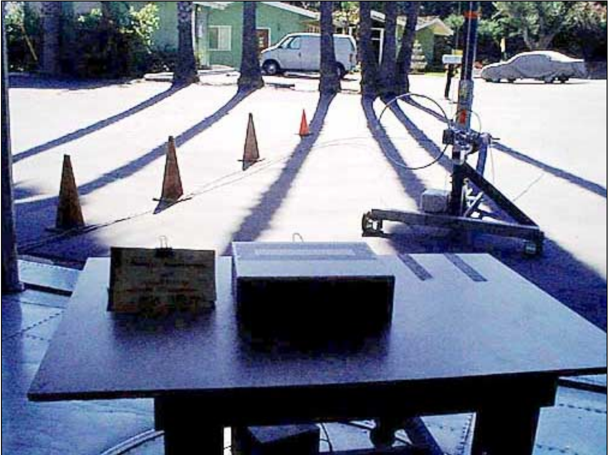
Radiated Emissions - Front View - With Loop Antenna