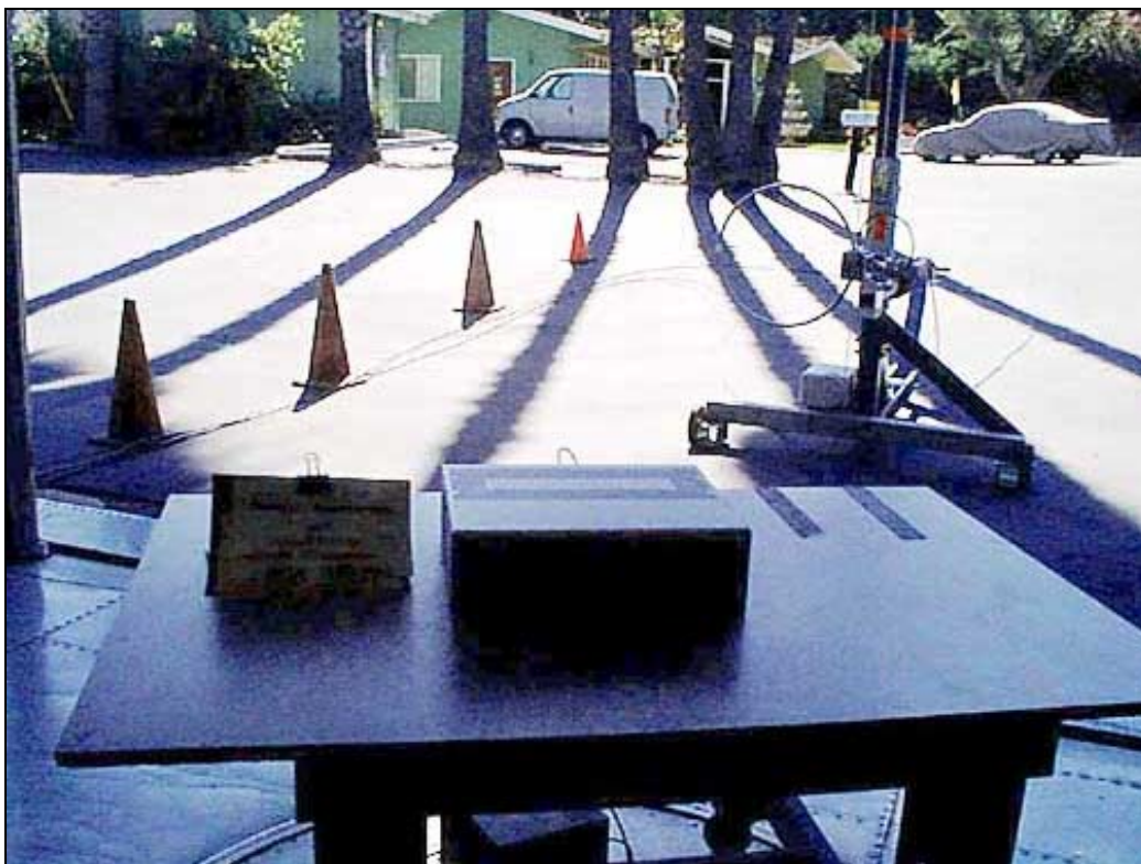
Radiated Emissions - Front View - With Loop Antenna