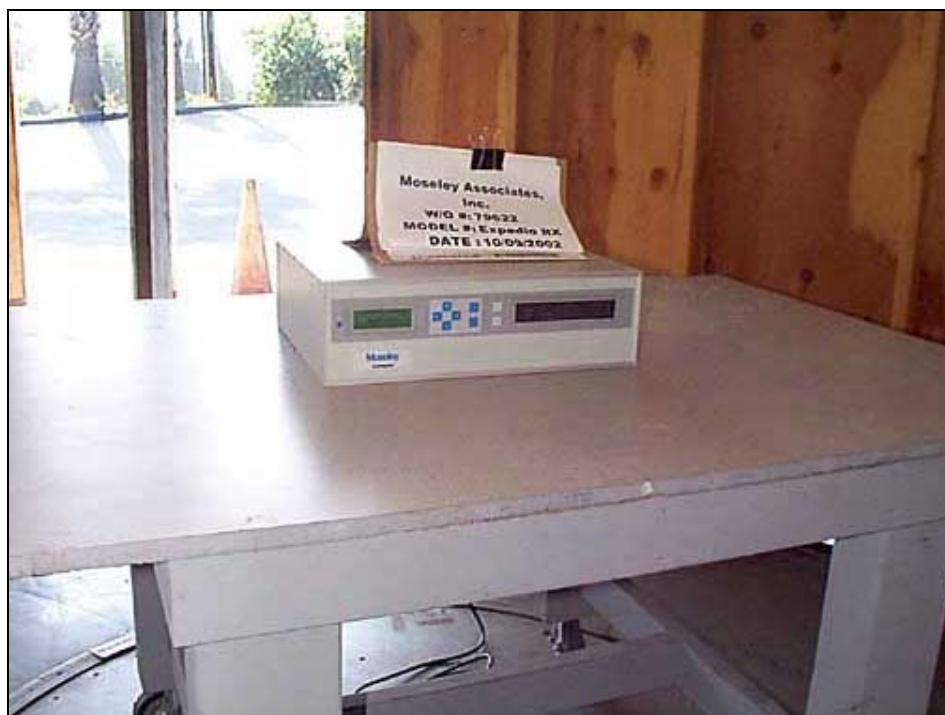
Radiated Emissions - Front View - Receiver