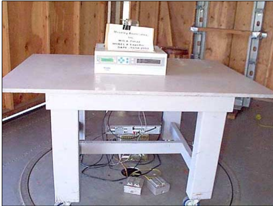
OATS - Front View