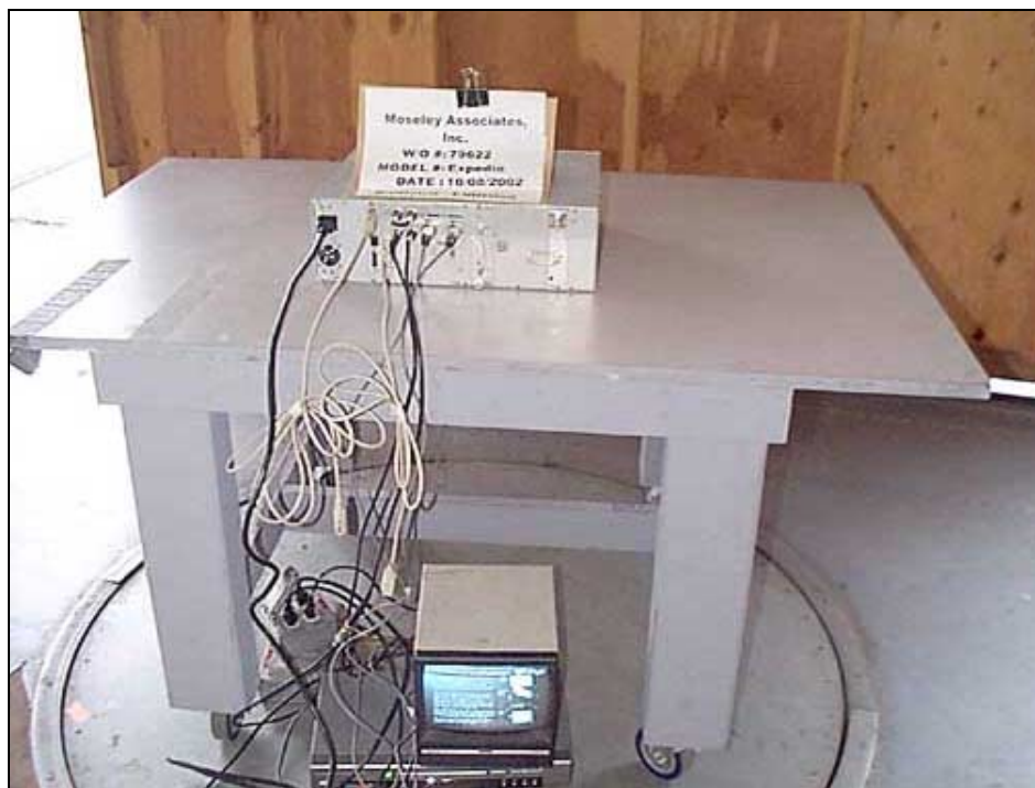
Radiated Emissions - Back View - With UTP Removed