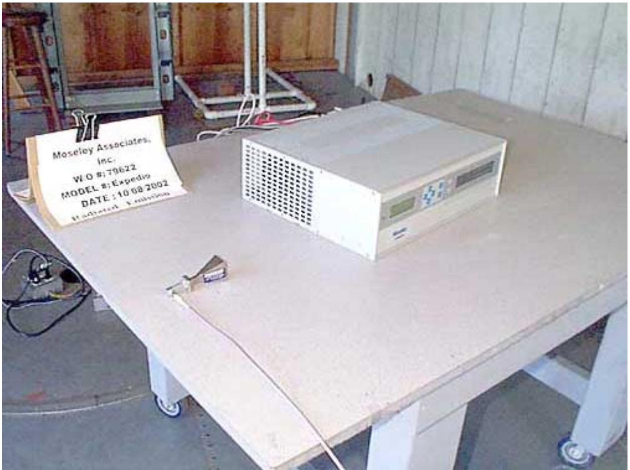
Direct Connect >1 GHz