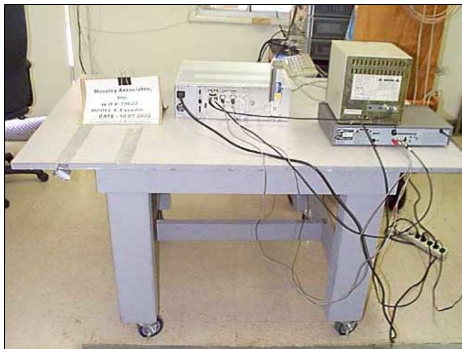
Direct Connect - Back View