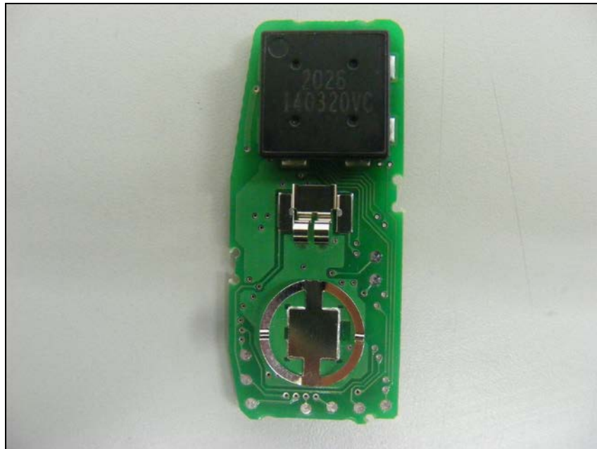
Bottom view of Main PCB