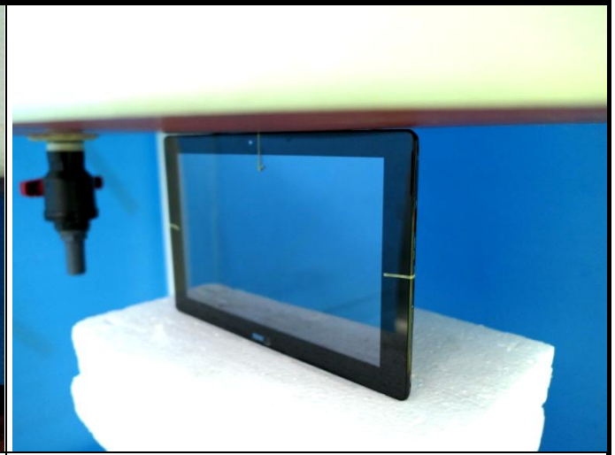
Body - Top Side of EUT at 0 mm