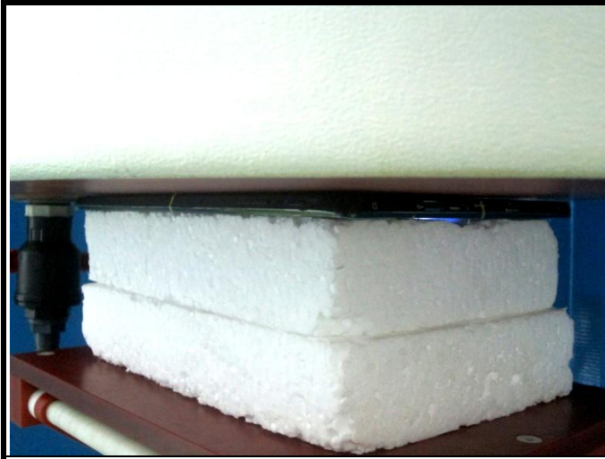
Body - Rear Face of EUT at 0 mm