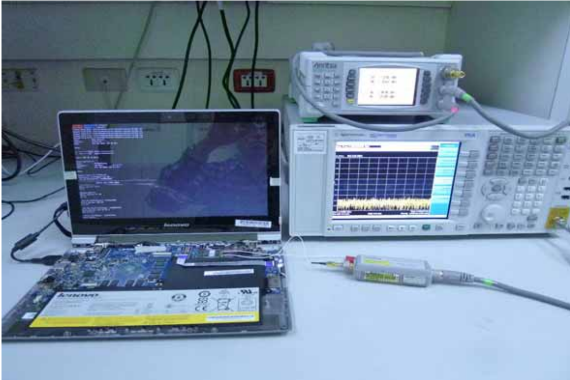
WLAN (ac 80M)