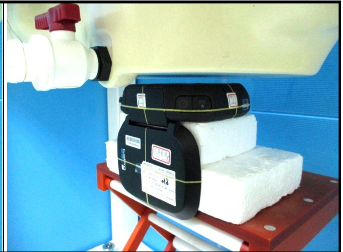
Bottom Side of EUT with 1 cm Gap