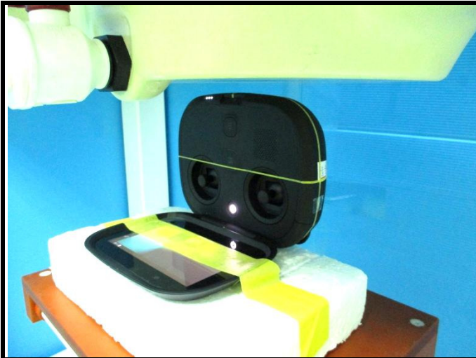
Front Face of EUT with 1 cm Gap