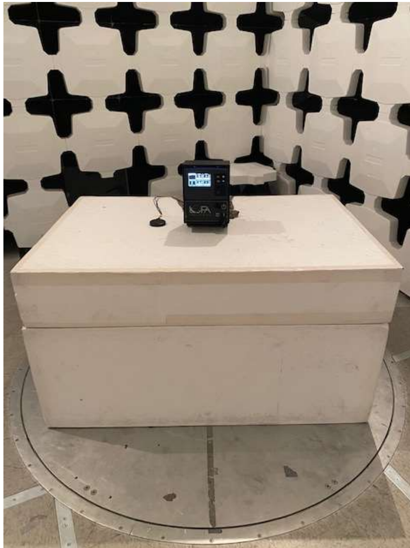
Figure 1. Radiated Emissions Test Setup