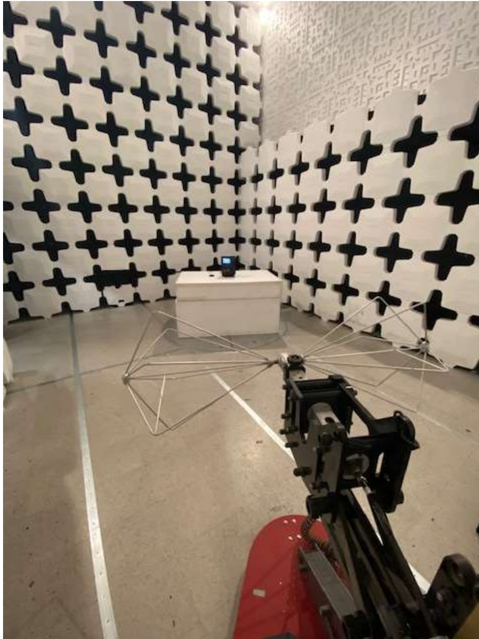
Figure 3. Radiated Emissions Test Configuration (30-200 MHz)