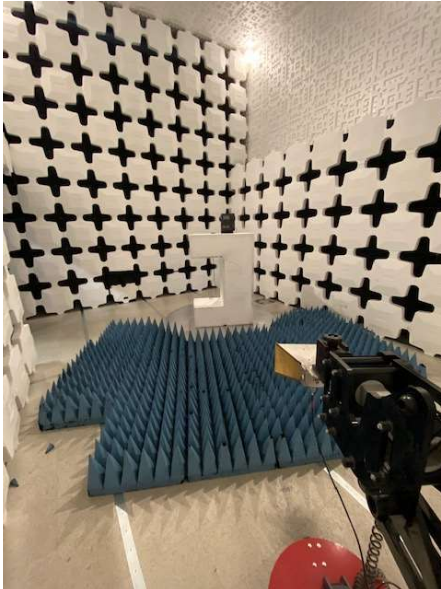
Figure 5. Intentional Radiated Emissions Test Configuration (Above 1 GHz)