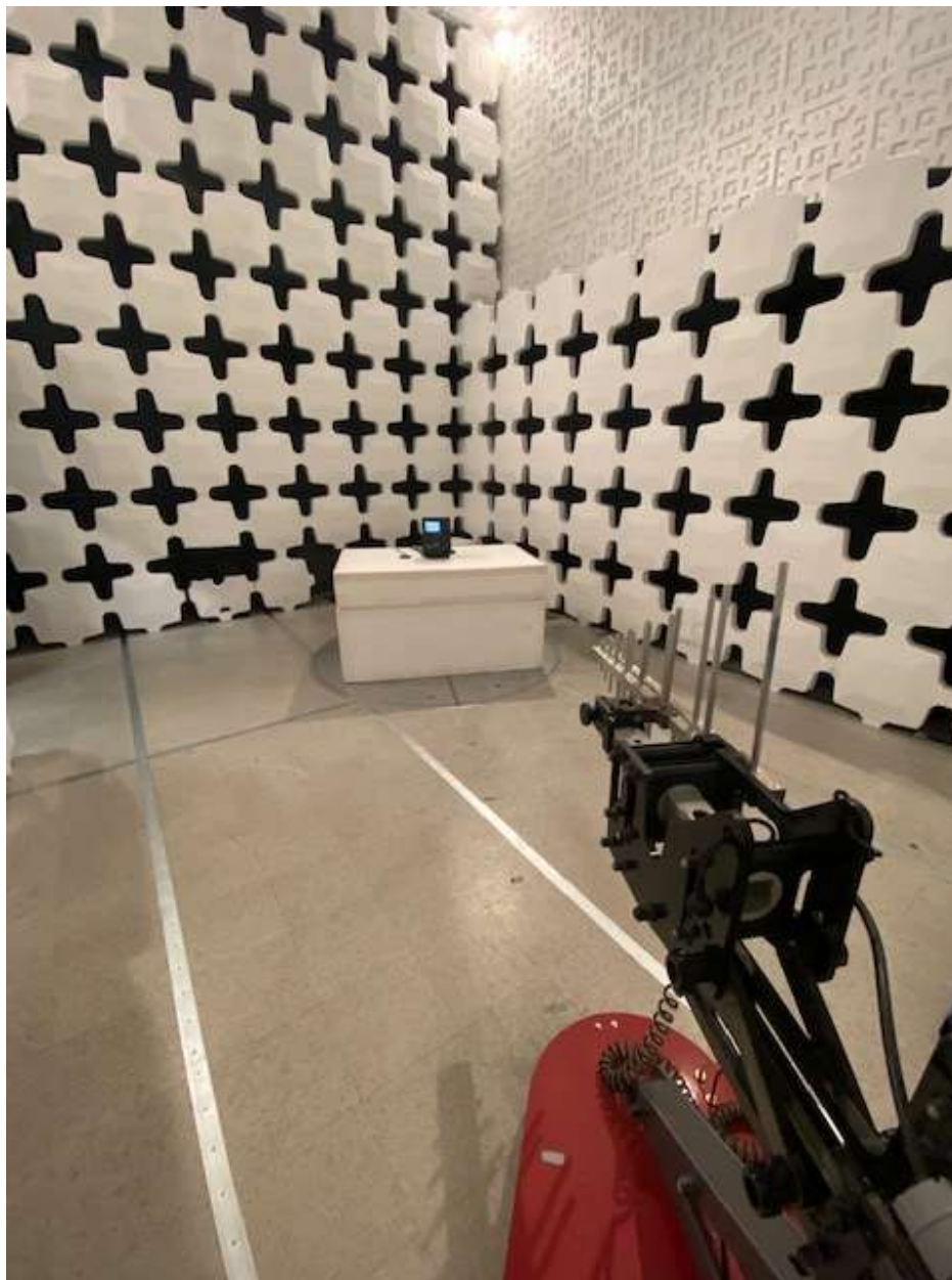
Figure 4. Radiated Emissions Test Configuration (200 MHz to 1 GHz)

FCC Part 15.209/249 CN2-CP1000BLE 1007A-CP1000BLE 20-0304 November 30, 2020 CP1000BLE