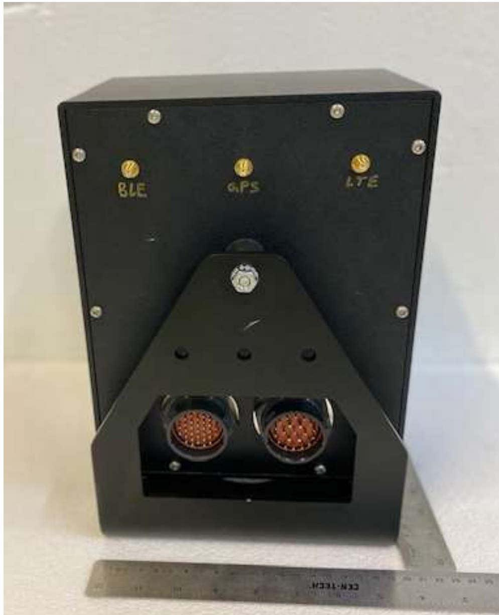
Figure 2. EUT, Back

FCC Part 15.209/249 CN2-CP1000BLE 1007A-CP1000BLE 20-0304 November 30, 2020 CP1000BLE