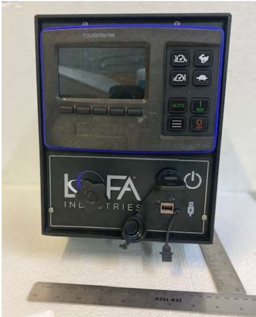
Figure 1. EUT, Front