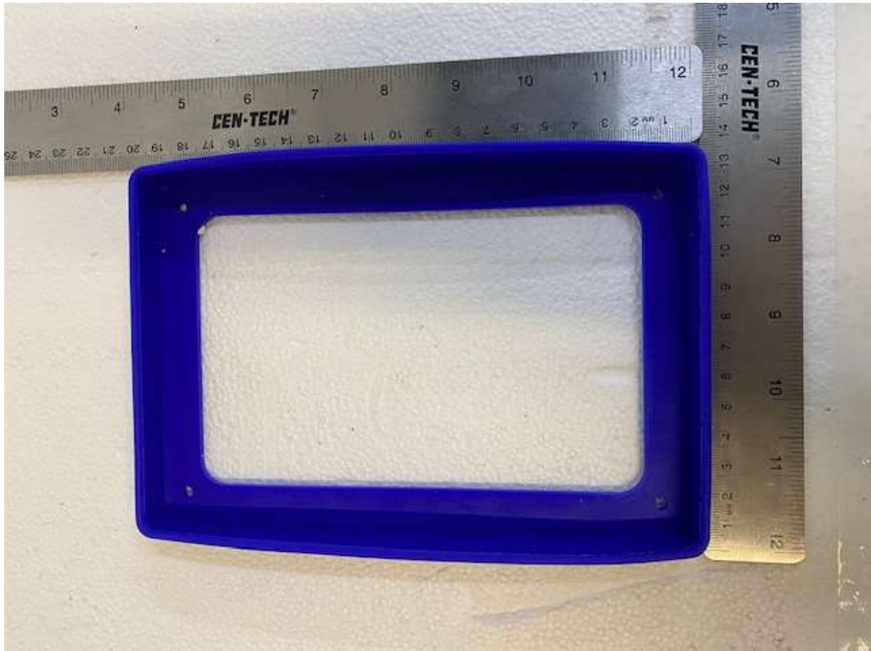
Figure 9. HMI Panel Gasket

FCC Part 15.209/249 CN2-CP1000BLE 1007A-CP1000BLE 20-0304 November 30, 2020 CP1000BLE