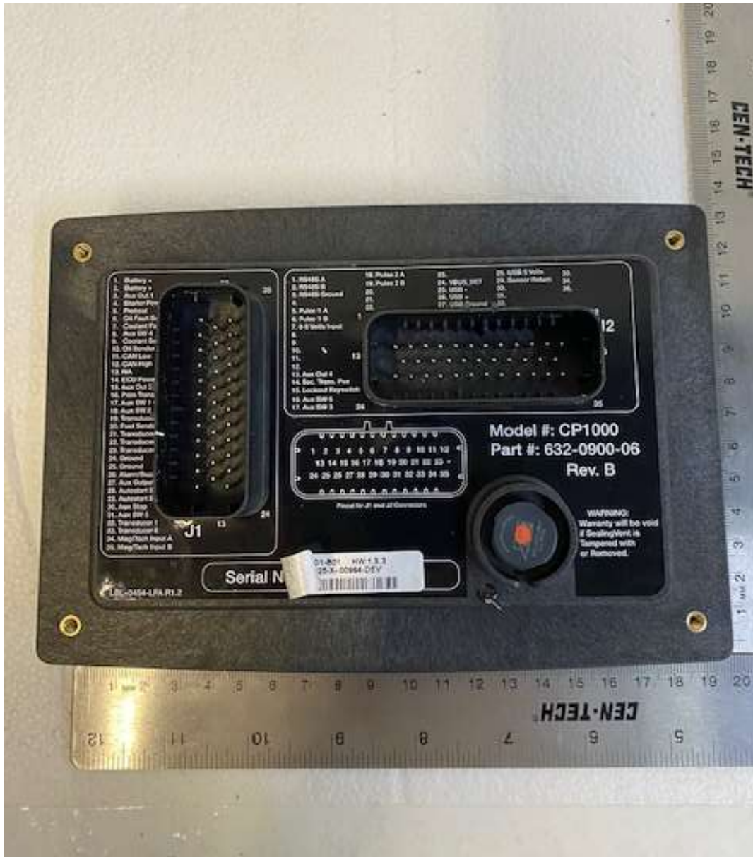
Figure 8. HMI Panel Removed – Back

FCC Part 15.209/249 CN2-CP1000BLE 1007A-CP1000BLE 20-0304 November 30, 2020 CP1000BLE