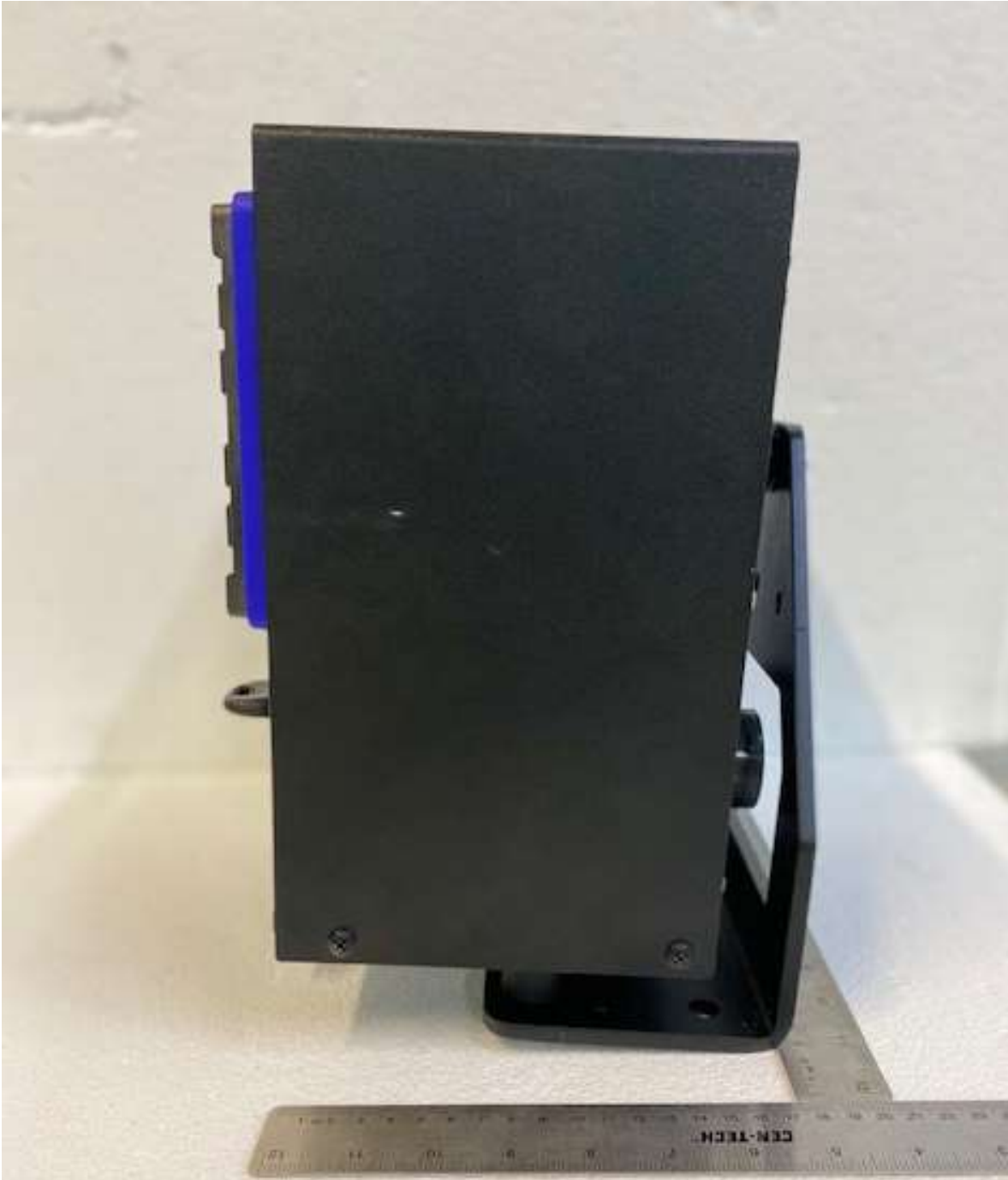
Figure 5. EUT, Right Side

FCC Part 15.209/249 CN2-CP1000BLE 1007A-CP1000BLE 20-0304 November 30, 2020 CP1000BLE