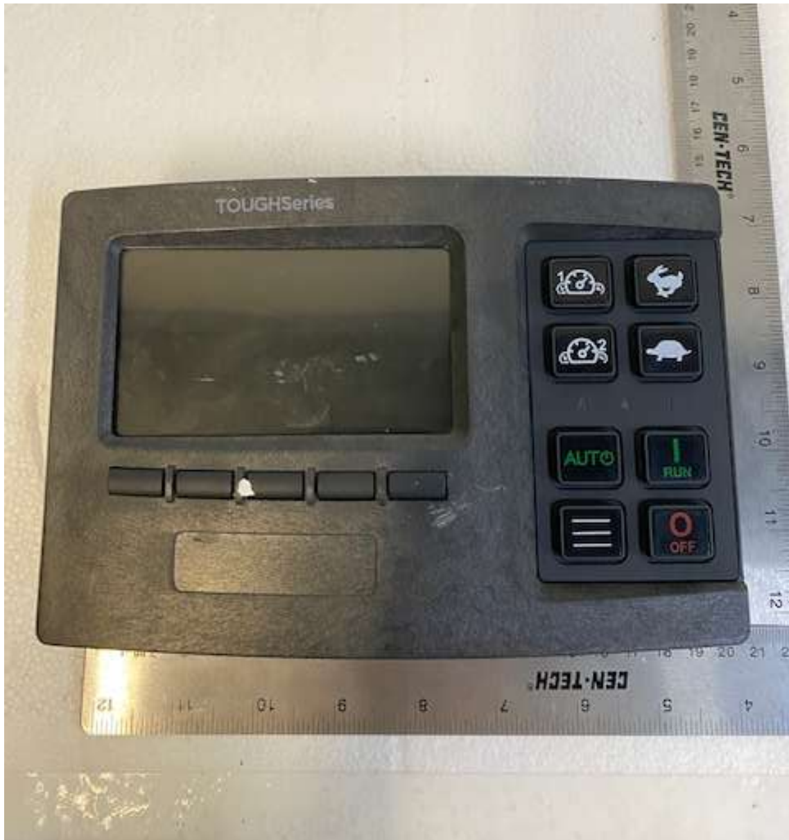
Figure 7. HMI Panel Removed – Front

FCC Part 15.209/249 CN2-CP1000BLE 1007A-CP1000BLE 20-0304 November 30, 2020 CP1000BLE