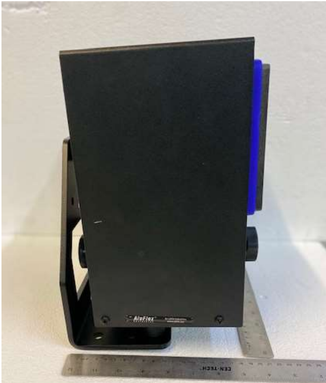
Figure 6. EUT, Left Side

FCC Part 15.209/249 CN2-CP1000BLE 1007A-CP1000BLE 20-0304 November 30, 2020 CP1000BLE