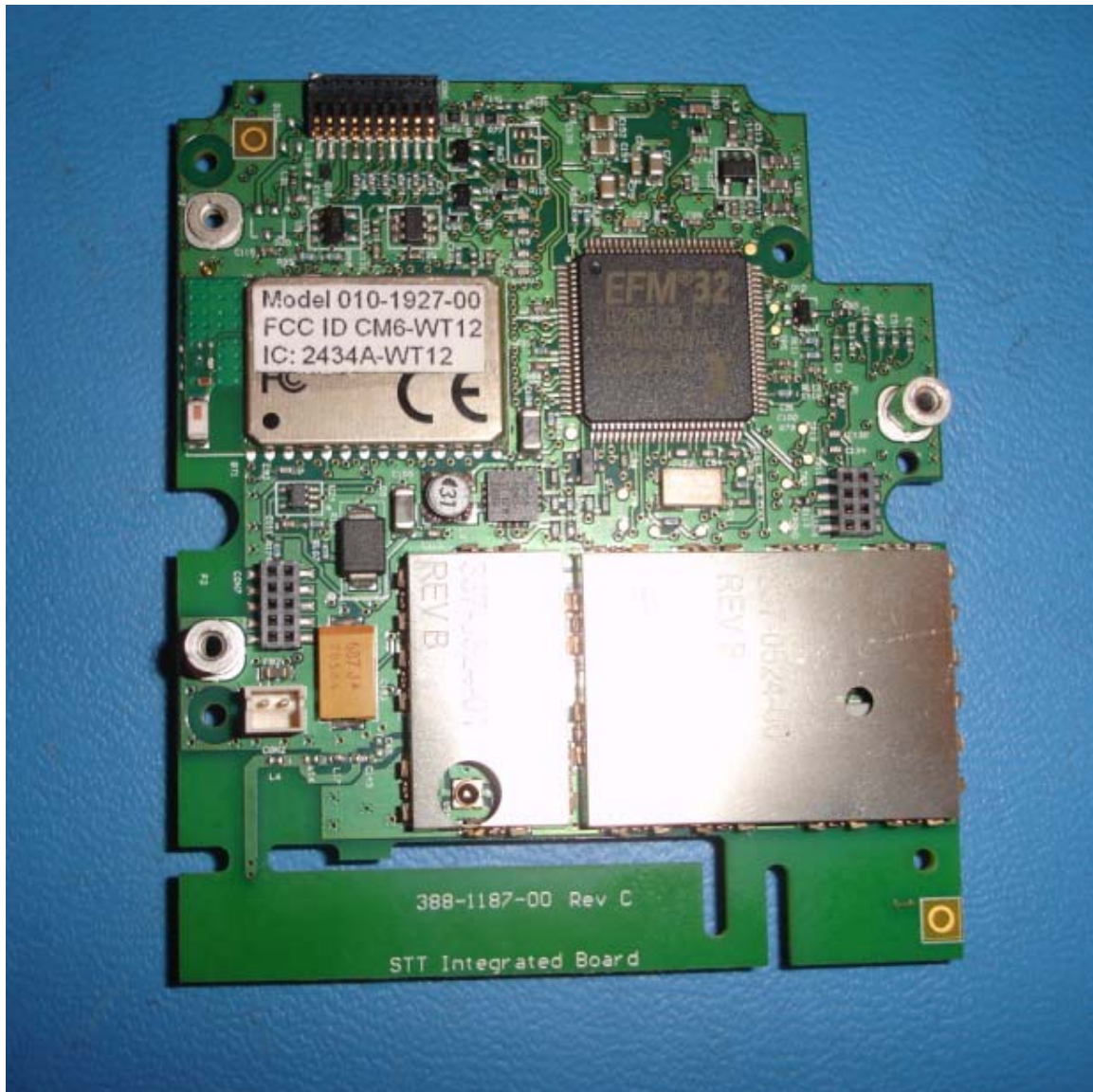
Figure 1: Labeling of the module when fitted to a typical PCB assembly. The label will show the Spacelabs part number (model), the FCC ID, and the Industry Canada IC number.