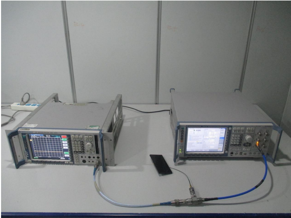
Radiated Test setup photos