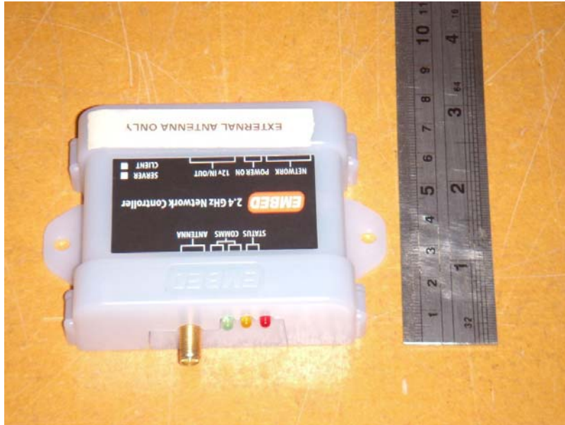
EUT Top Ports