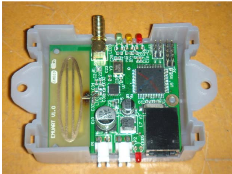
EUT Internal View & PCB (Component Side)

This document shall not be reproduced in any form except in full.