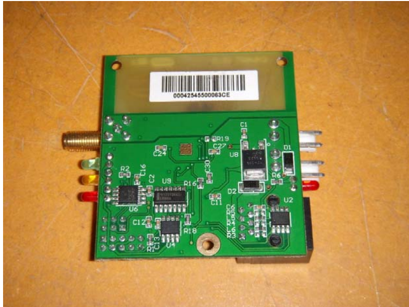
EUT PCB (Trace Side)