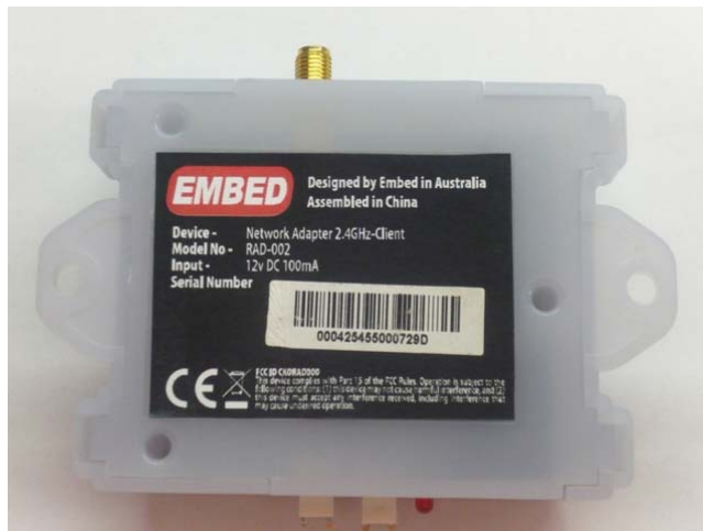
FCC Label Location on EUT

This document shall not be reproduced in any form except in full.