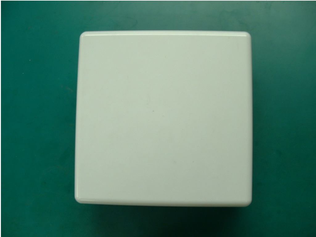
TypeW WT External View1