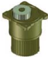
Motor & Motor driver