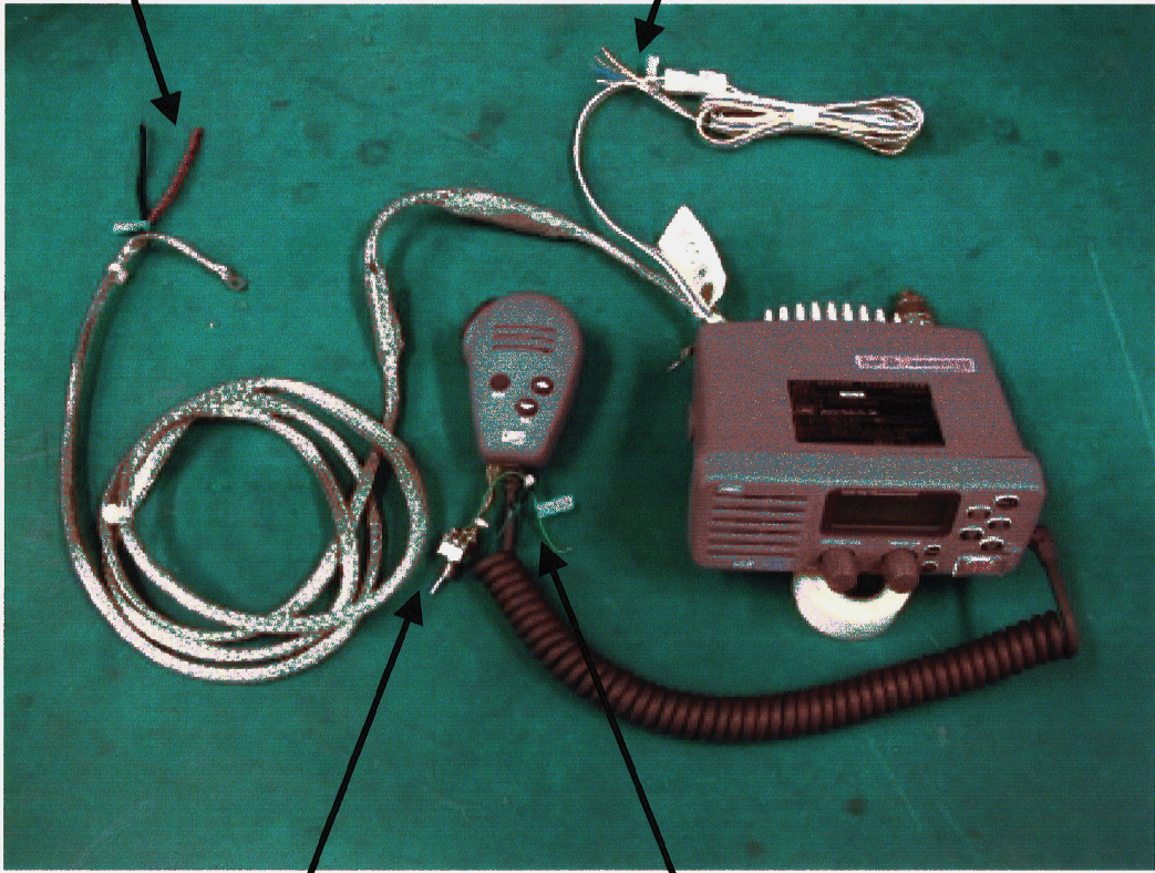
PTT / Ext. MIC Switch

NMEA+ : Blue Ext. SP+ : Yellow NMEA- : White Ext. SP- : Green