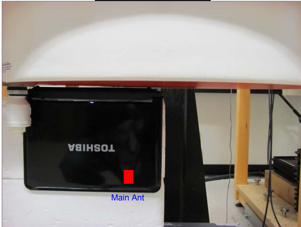
Laptop Mode: Lap-held Position