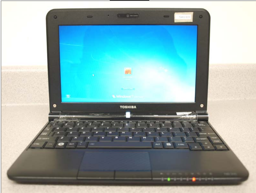
NB 300 / 305