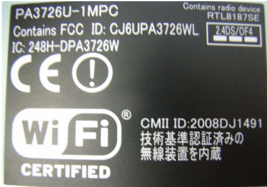
Regulatory Label of Realtek RTL8187SE on bottom of PC