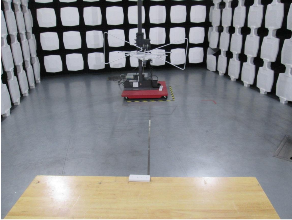
Figure 2 Radiated emission test setup (below 1 GHz)