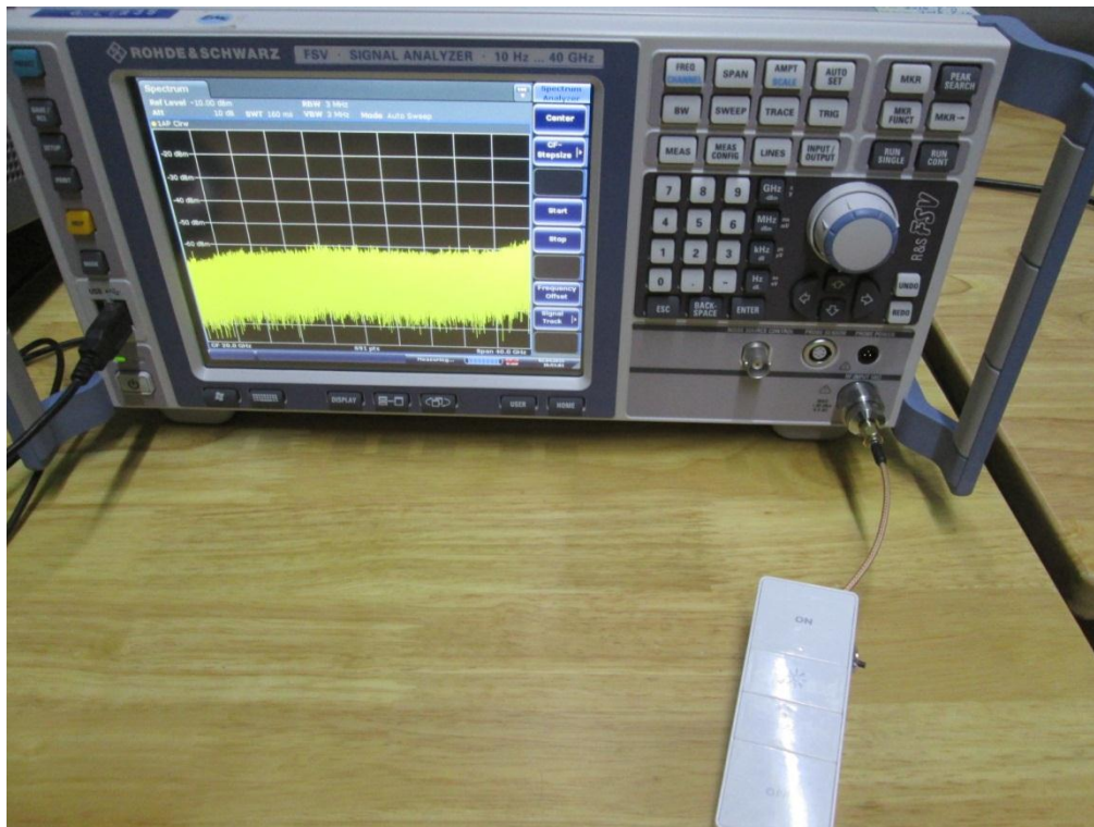
Figure 1 Conducted measurement Test setup