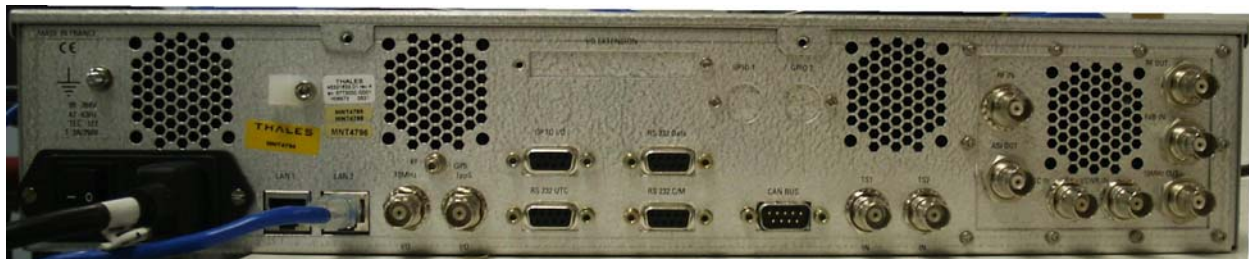
Figure 3 Exciter (rear view)

All information contained in this document is confidential and proprietary to THALES and shall not be disclosed without the prior permission of THALES.