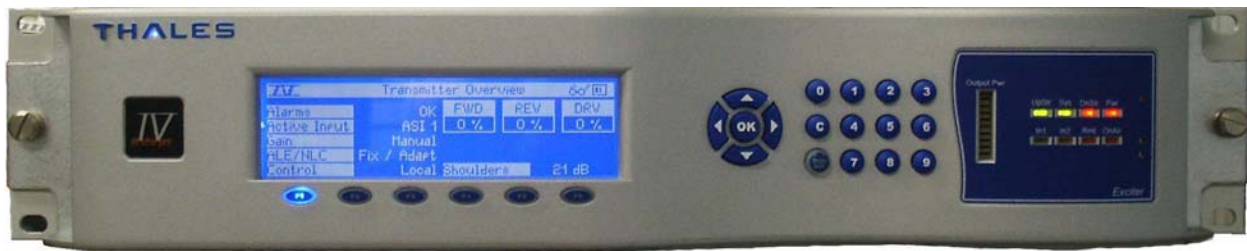
Figure 2 Exciter (front view)