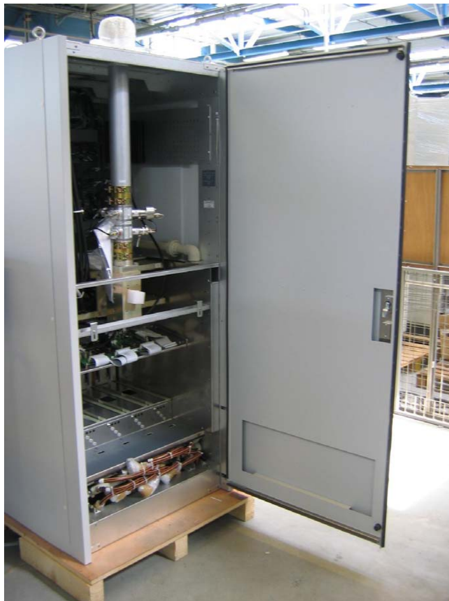
Figure 1: Digital transmitter system (Rear view)

All information contained in this document is confidential and proprietary to THALES and shall not be disclosed without the prior permission of THALES.