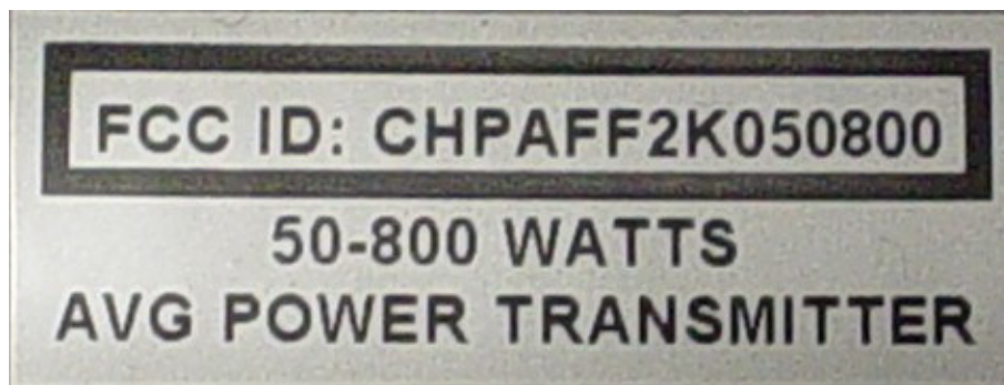
Figure 1 FCC ID Label

The FCC ID label to be affixed to the transmitters rear panel is shown below. It details the FCC ID number chosen for the transmitter series, the equipment model number according to type, and limits to range of operating power for that equipment type. Refer to Figure 4 below for actual label placement on the transmitter unit.