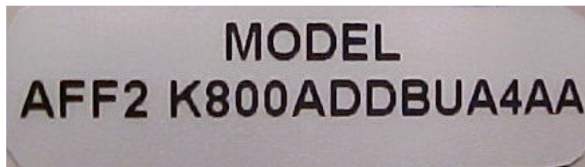
Figure 2 Model Number ID Label