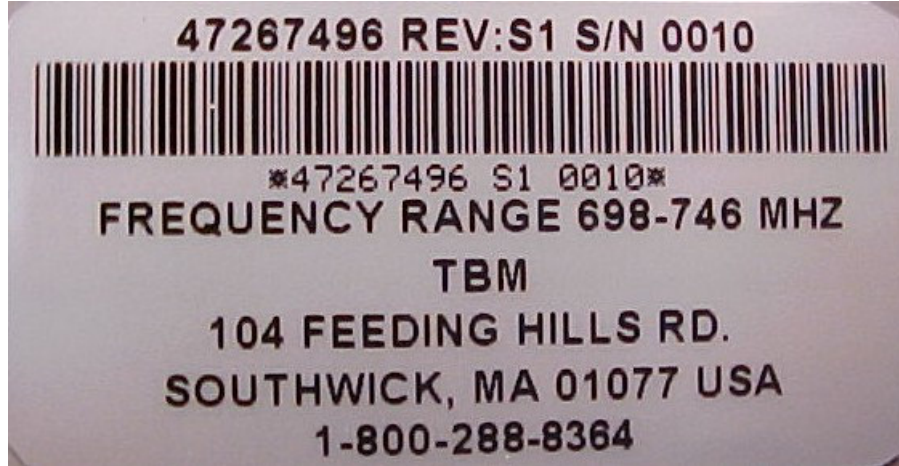
Figure 3 Manufacturer Label