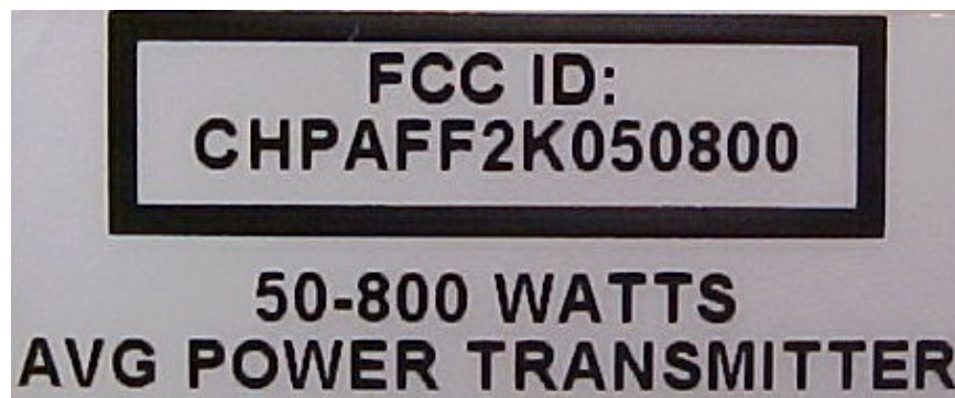
Figure 1 FCC ID Label

The FCC ID label to be affixed to the transmitters rear panel is shown below. It details the FCC ID number chosen for the transmitter series, the equipment model number according to type, and limits to range of operating power for that equipment type. Refer to Figure 4 below for actual label placement on the transmitter unit.