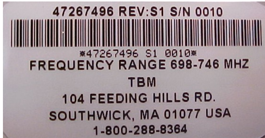
Figure 3 Manufacturer Label