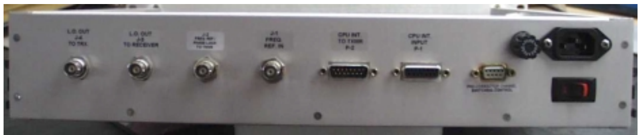
Figure 3: Agile synthesizer drawer rear panel.