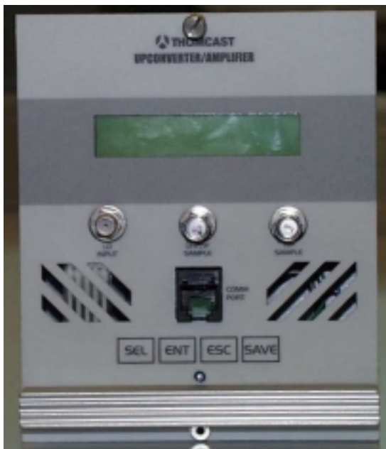
Figure 8: Upconverter module front panel.