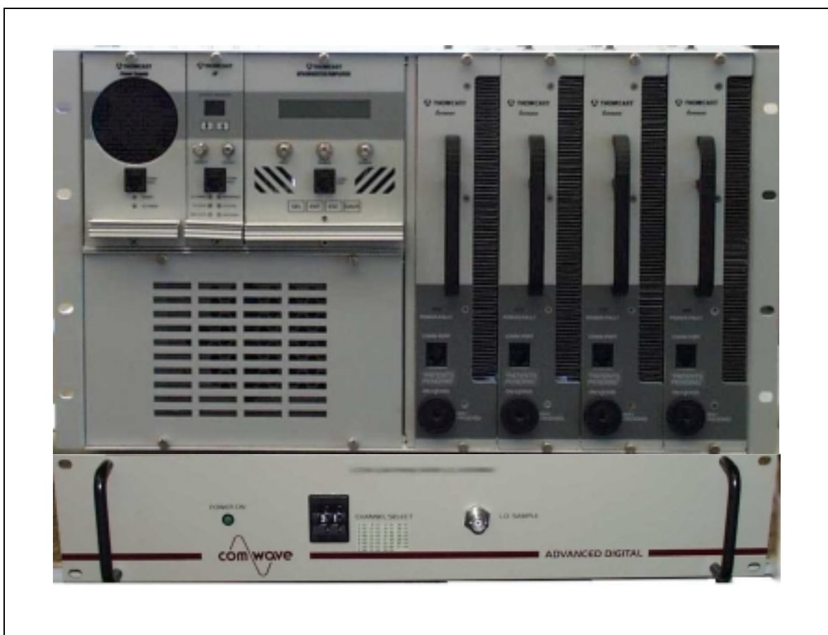
Figure 1: SDA5000C transmitting system (SD5000C with Agile Synthesizer Drawer).