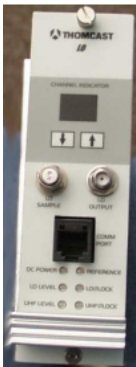
Figure 6: LO plug-in module front panel.