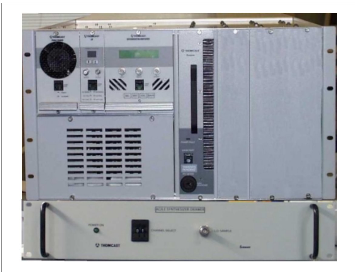
Figure 1: SDA1250C transmitting system (SD1250C with Agile Synthesizer Drawer).