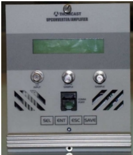
Figure 8: Upconverter module front panel.