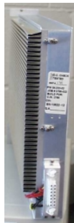
Figure 11: Power amplifier segment rear panel.