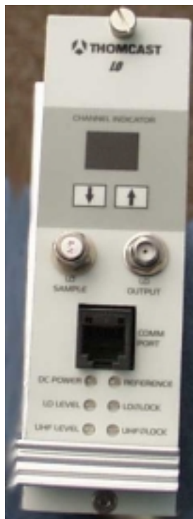
Figure 6: LO plug-in module front panel.