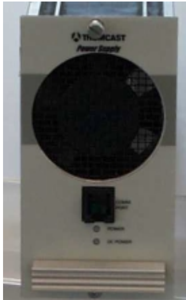
Figure 4: Power supply plug-in module front panel.