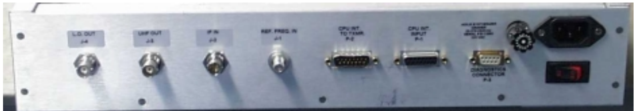
Figure 3: Agile synthesizer drawer rear panel.