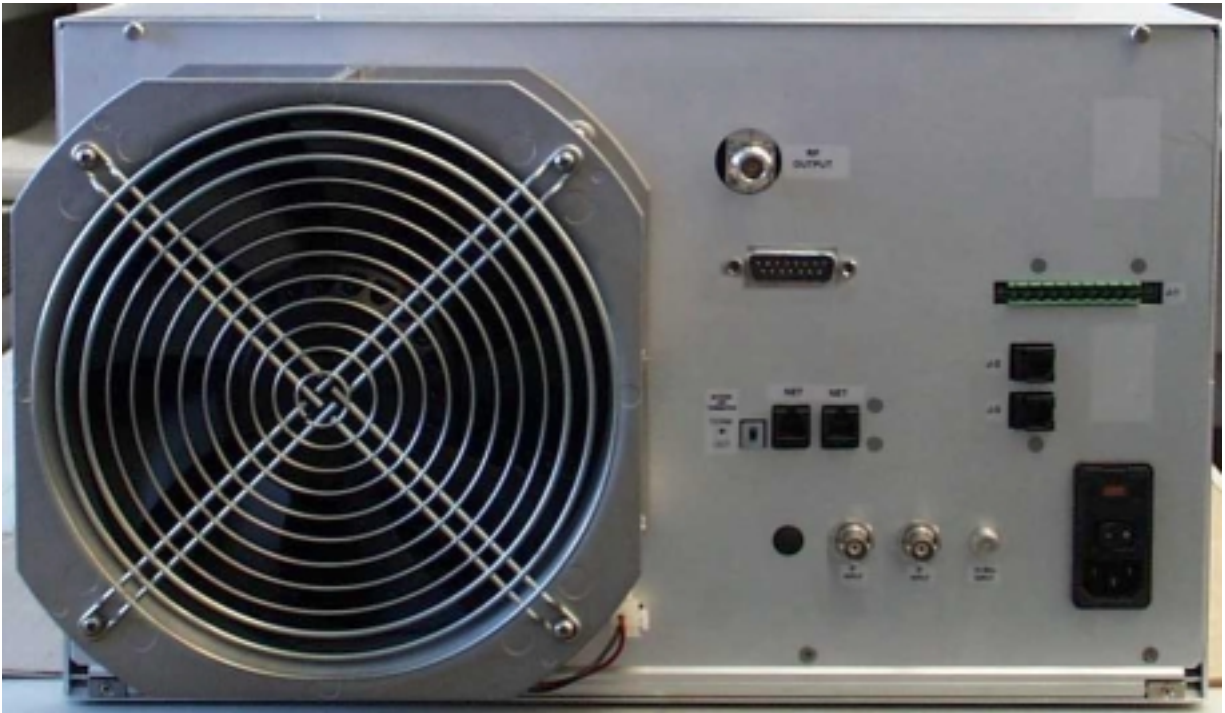
Figure 2: Sub-chassis rear panel.