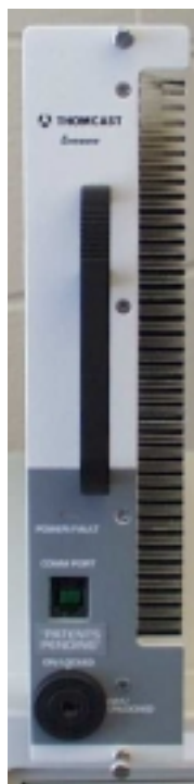
Figure 10: Power amplifier segment front panel.