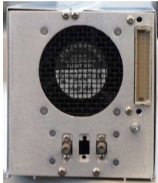
Figure 9: Upconverter module rear panel.