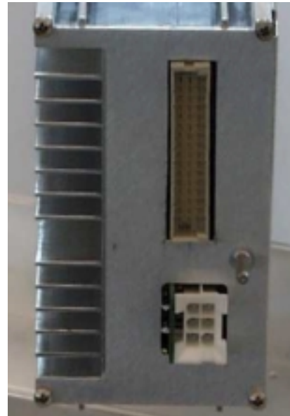
Figure 5: Power supply plug-in module rear panel.