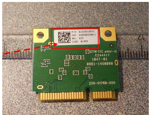
FCC & IC ID Label on the Module