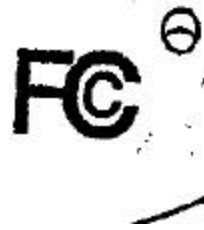
Close-up of FCC label on Base

This device complies with Part 15 of the FCC Rules. Operation is subject to the following two conditions: (1) this device may not cause harmful interference, and (2) this device must accept any interference received, including interference that may cause undesired operation.