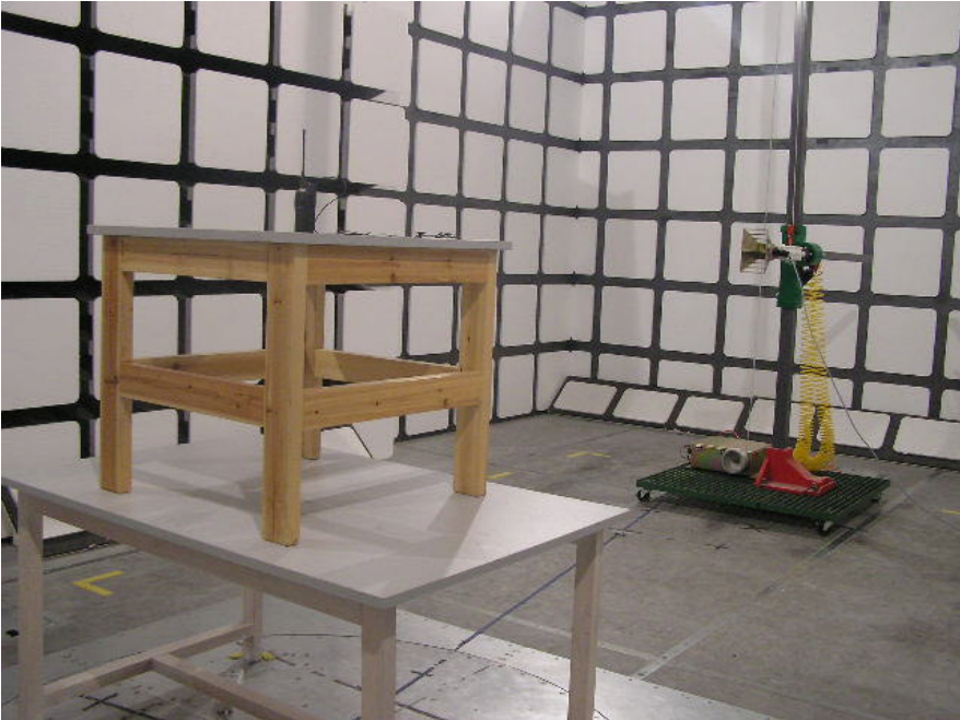
Radiated Emission - Rear View (Above 1000 MHz)