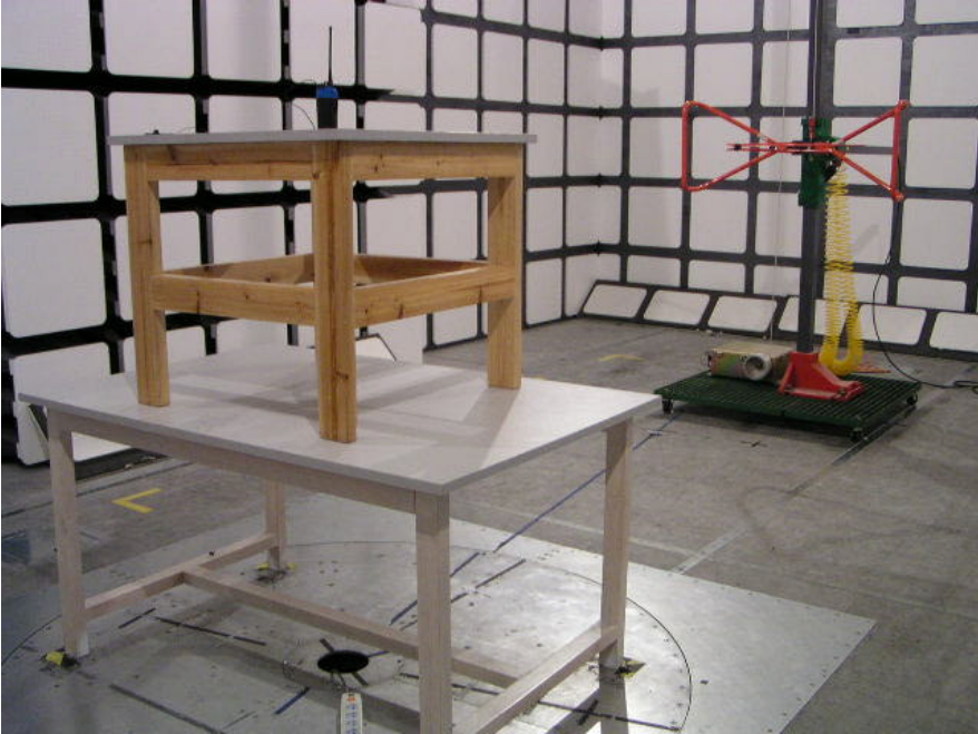
Radiated Emission - Rear View (30-1000 MHz)