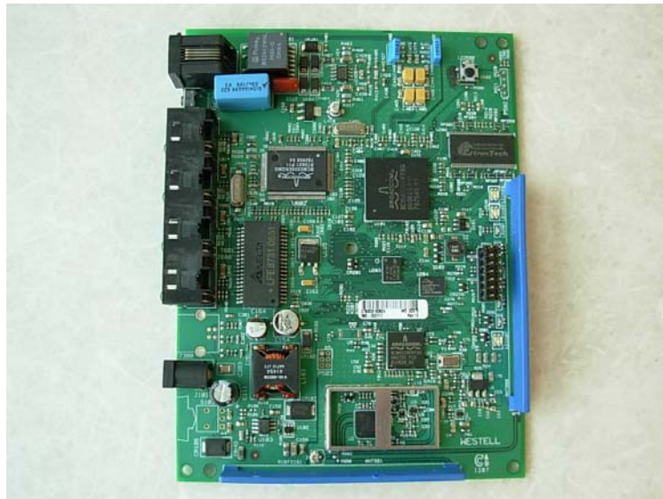
The Antennas are the two long blue items on the edge of the PCB.