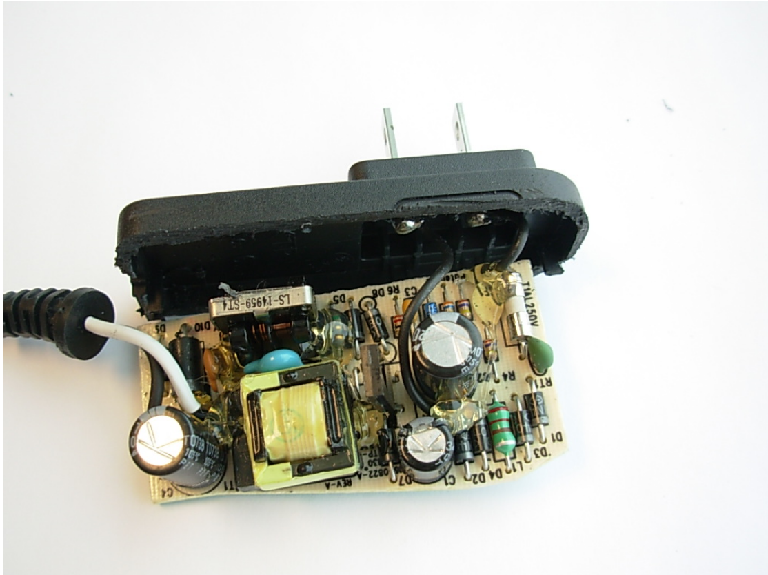
Figure 2. Photograph of Power Supply Board: Foil Side