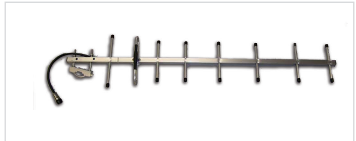
746-896 MHz Yagi Antenna, 11 dBi