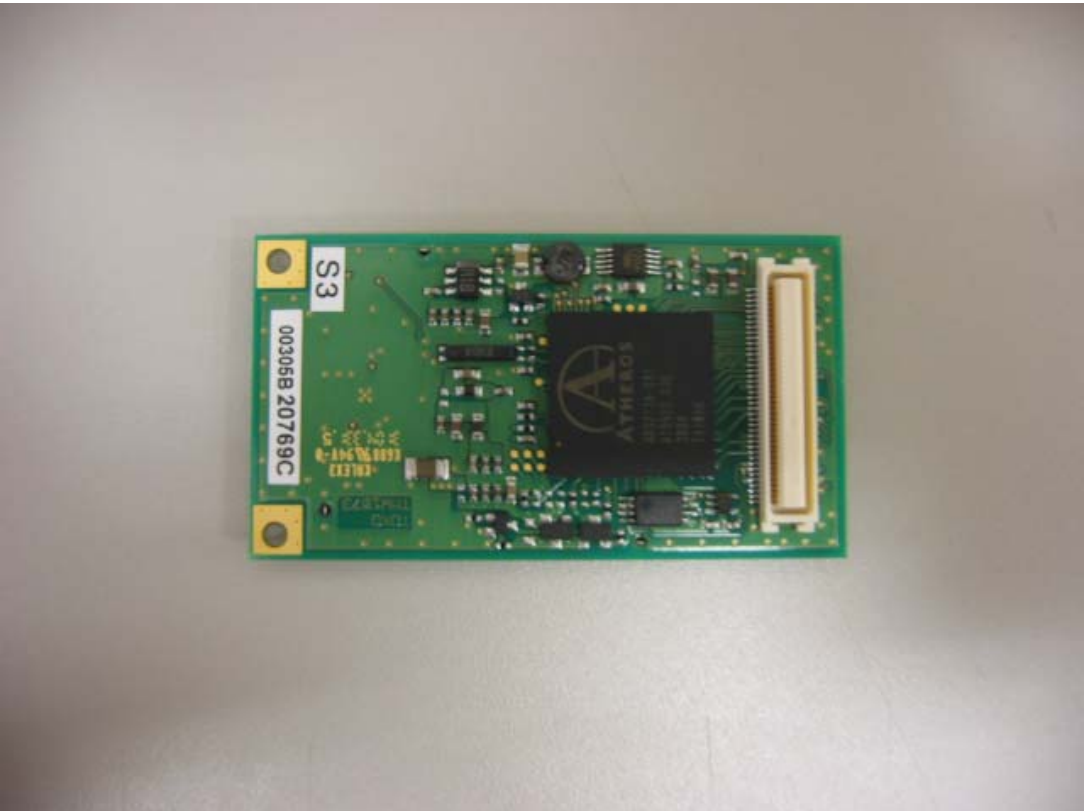
Rear of Wireless LAN module (with shielded)