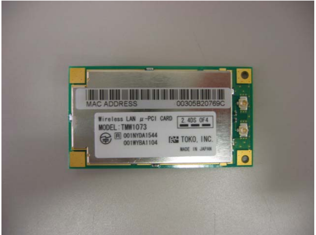
Front of Wireless LAN module (with shielded)