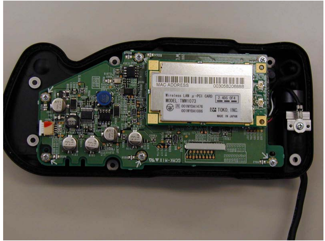
Wireless Transmitter Cover Opened (without cover)