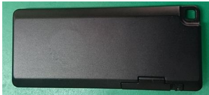
FCC ID and ISED Number are marked on the bottom case with laser marking.