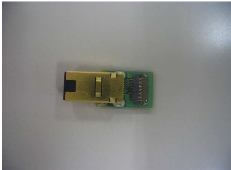
P1ALF PCBA—A Side