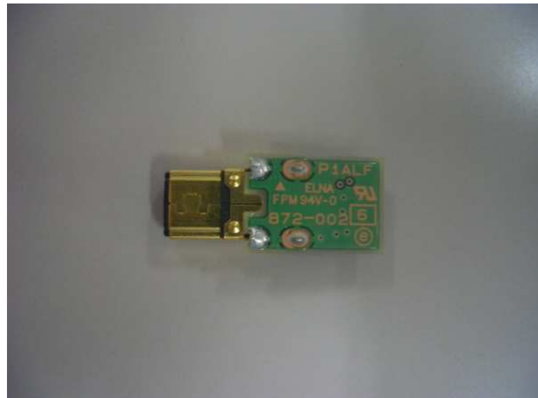
P1ALF PCBA—B Side