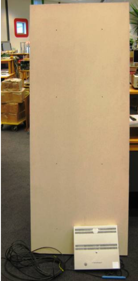
Front side of Antenna EQ45-F