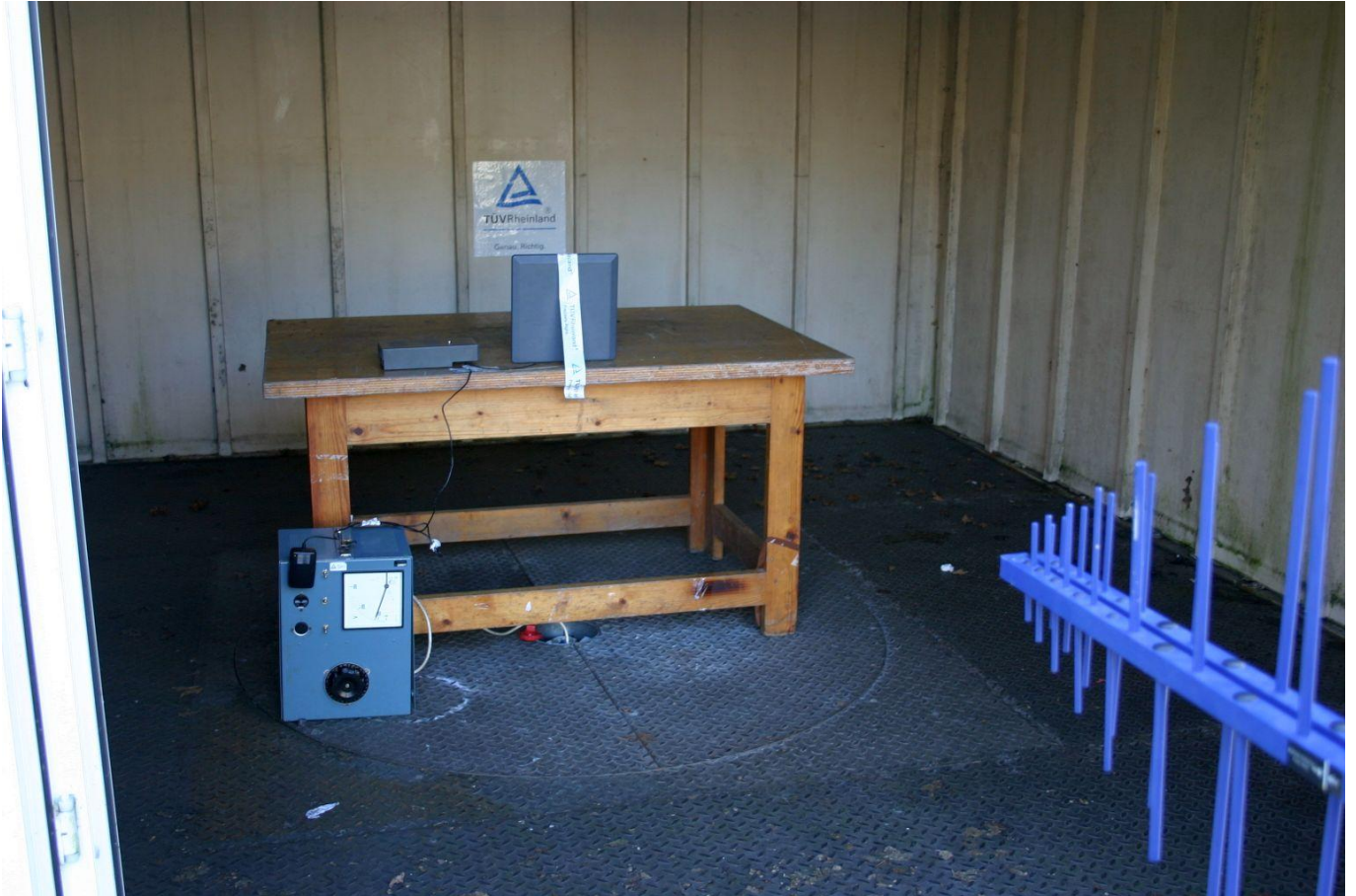
Radiated emission setup, Electric field