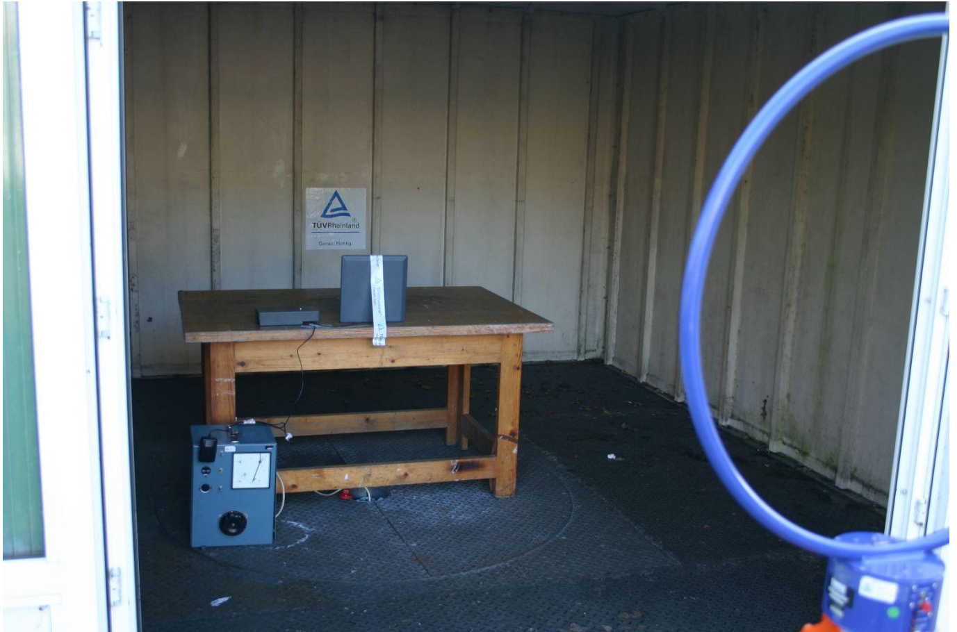
Radiated emission setup, Magnetic field