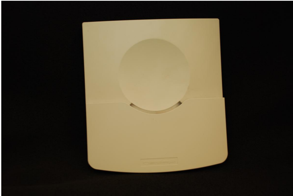
Photograph 1: Top view