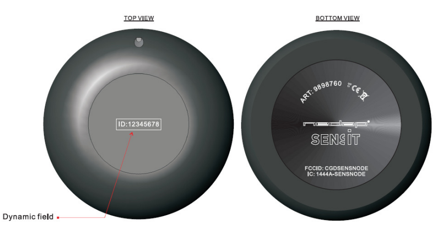
Figure 2: Top and bottom laser engraved sides of the SENSIT

The node ID is mentioned on the top of the housing under ID. There is also a 125kHz passive RFID label embedded into the SENSIT. This can be used for verification of the SENSIT or to localize the SENSIT on the parking lot.