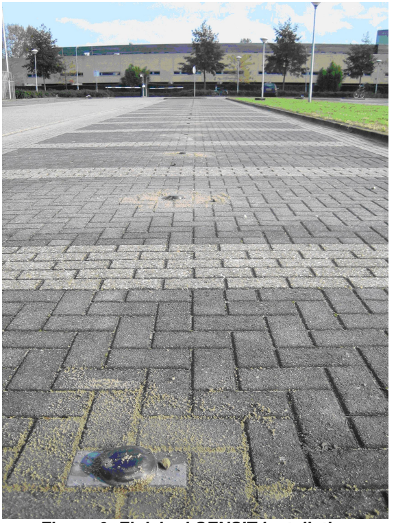
Figure 6: Finished SENSIT installation

Note: When the SENSIT are not calibrated they hardly send any messages. This is due to the fact that there are no events generated because the magnetic tressholds are not crossed.