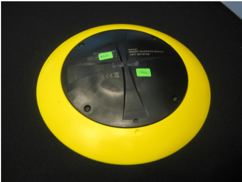
SENSIT SURFACE MOUNT (yellow)

N.V. Nederlandsche Apparatenfabriek "Nedap" Parallelweg 2 NL-7141 DC Groenlo P.O. Box 6 NL-7140 AC Groenlo