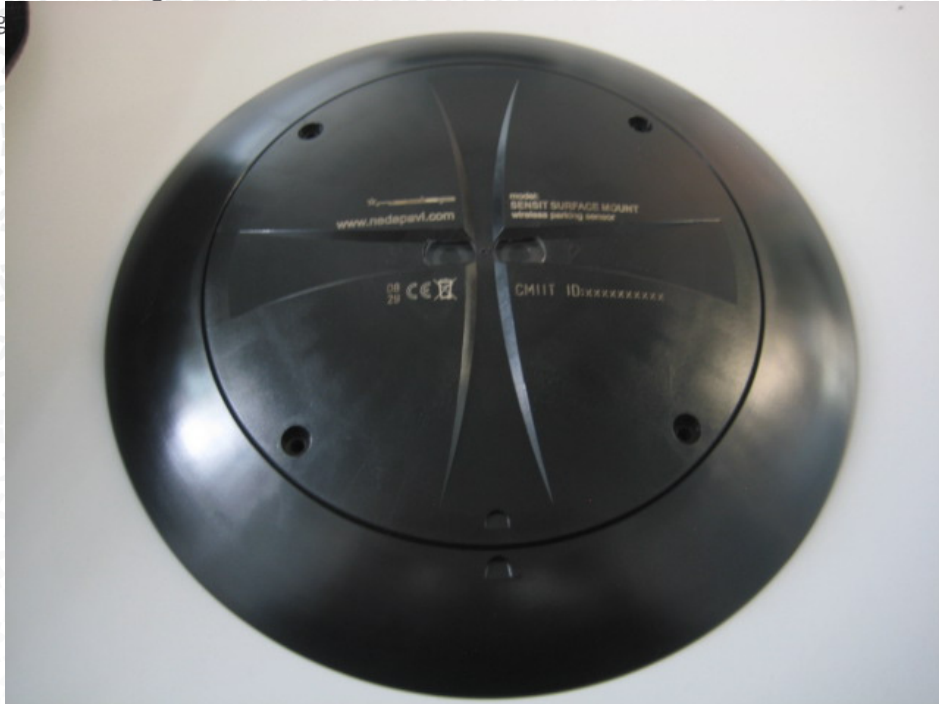
SENSIT SURFACE MOUNT (black)